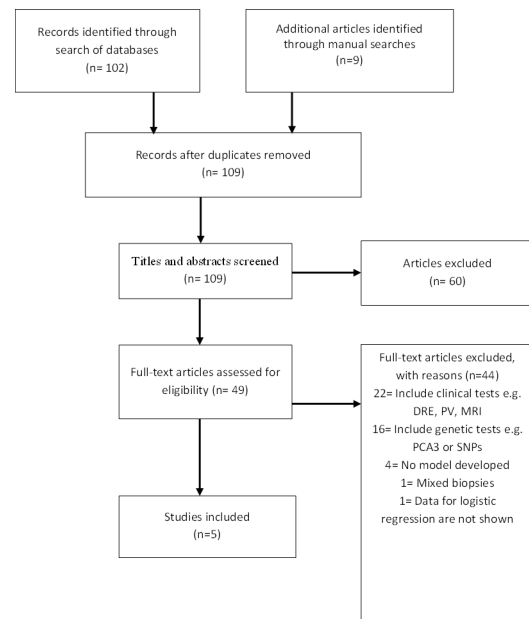
Figure 1 Flow diagram of studies included using the Preferred Reporting Items for Systematic Reviews and Meta-Analyses method. DRE, digital rectal examination; PCA3, prostate cancer antigen 3; PV, prostate volume; SNP, single nucleotide polymorphism.

The quality of the studies included in this review was assessed using the Prediction model Risk Of Bias Assessment Tool (PROBAST). 60 This tool has been developed specifically to assess the risk of bias and applicability for prediction model studies. The tool consists of four domains and has 20 signalling questions that facilitate reaching overall judgement of risk of bias, as well as issues relating to applicability.