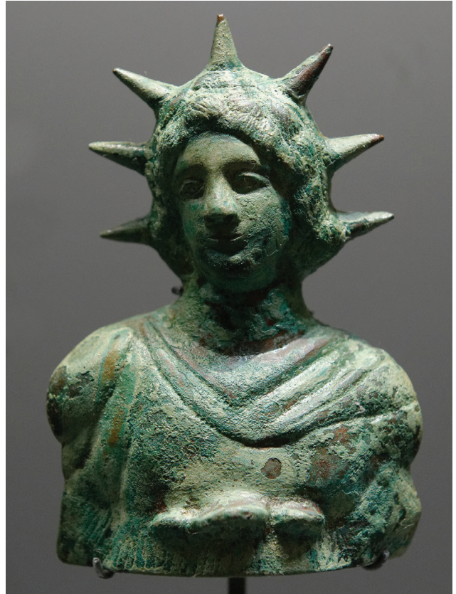
Figure 1. Bust of Helios, radiate (seven rays), with long hair, wearing a chlamys, a short cloak worn by men in ancient Greece. 1st century CE. Public domain image by Marie-Lan Nguyen. Holding institution: Louvre Museum, Paris, France.

In ancient Rome, the linkage between the power of rulers and the power of the sun was also frequently depicted on coinage. For example, a sovereign wearing a radiate crown on the front (obverse) of the coin and a personification of the sun also wearing a radiate crown and sometimes driving a quadriga on the back (reverse) was common. Figure 2 is an example of such coinage from 274 CE, featuring the emperor Aulerian wearing a radiate crown on the obverse, and, on the reverse, a personification of the official sun god of the later Roman Empire, the Sol Invictus (Unconquered Sun), also wearing a radiate crown. In the modern era, positive artistic depictions of liberty