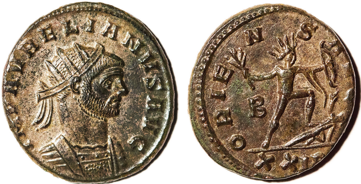
Figure 2. Antoninianus (2 denarii silvered bronze coin) of the Roman emperor Aurelian, 274–275 CE. Obverse: IMP AVRELIANVS AVG [Emperor Aurelian Augustus]. Crowned and cuirassed bust of Aurelian facing right. Reverse: ORIENS AVG [Eastern (rising) sun Augustus]. Crowned figure of Sol Invictus [Unconquered Sun] holding laurel branch and bow, stepping on conquered enemy. Private collection, Atlanta, Georgia.

epithelium and other tissues; the fusion unit mediates the subsequent fusion of the virus with endothelial cell membranes.