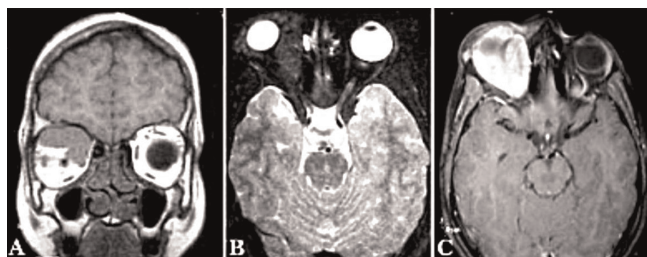
Figure 1. MRI (A) T1 Coronal image; an isointense mass located superio-medially in the right orbit, pushing the orbital contents. (B) T2 axial fat suppressed image; a hypointense, extraconal mass located medially in the right orbit, causing proptosis. No infiltration in the surrounding structures can be seen (C) Post-gadolinium axial image; intense contrast enhancement of the mass.

Based on the history, clinical presentation and radiological imaging, a diagnosis of orbital tumor was made. Surgical excision was carried out using the anterior fossa approach. Intraoperatively, the mass was located under the periorbital fascia. After opening this fascia, the frontal nerve and