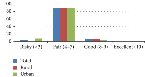
FIGURE 2: It depicts the food score categories among urban and rural participants.

3.3. Menstrual and Clinical History and Hirsutism. The average age at menarche was 12 (SD = 1) years. Oligomenorrhea (28%; n = 35 ) and irregular menses with weight gain (19%; n = 24 ) were the common menstrual disorders. The bleeding