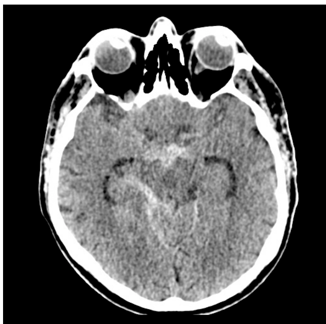
Fig. 2. Subarachnoid haemorrhage in the basal cisterns.