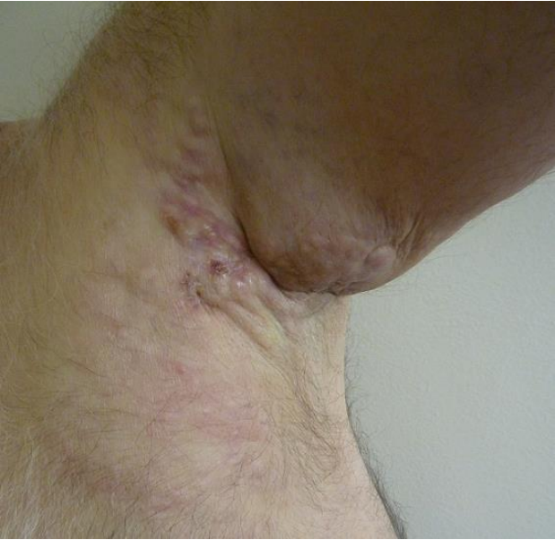
Figure 1: An axillary hummoky tumor