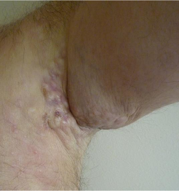
Figure 2: Burgeoning aspect of the tumor