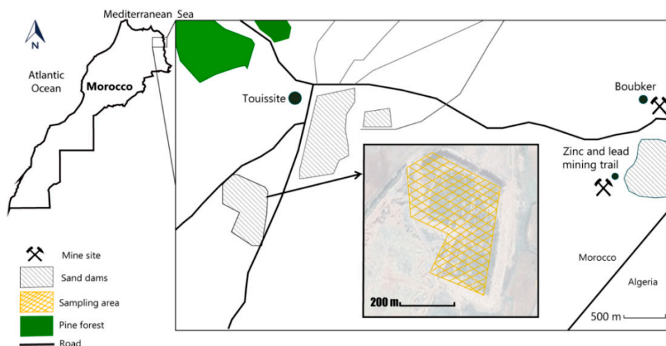
Figure 2. Plant and soil sampling area at Touissite site.