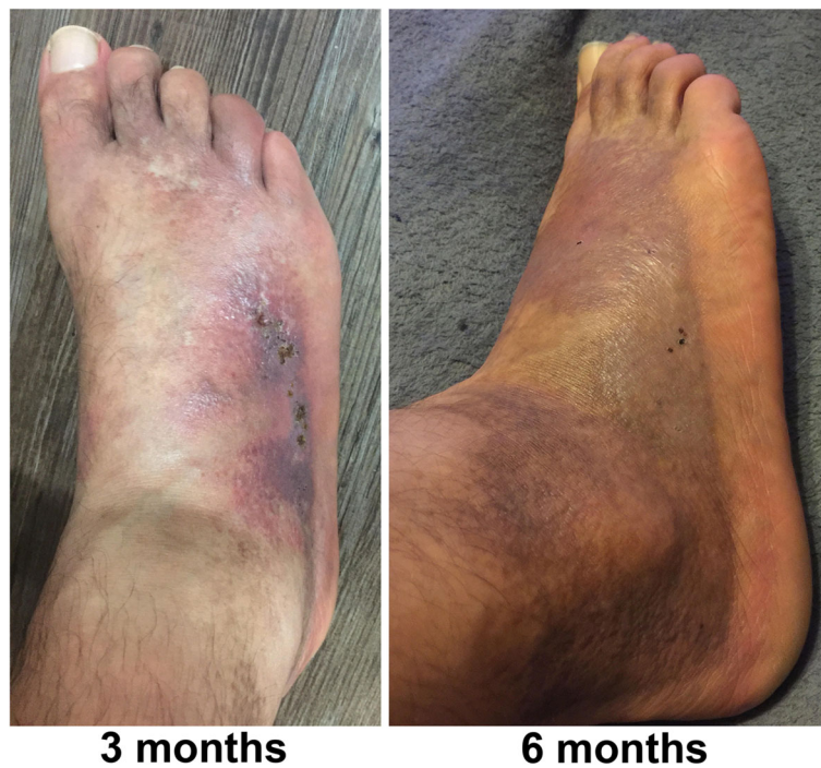
Fig. 3 The patient's right foot after four sequential intravenous infusions of allogeneic MSCs. A significant regression of trophic changes was observed 3 months after the last infusion. Near complete remission of skin lesions and ulcers was seen 6 months after the treatment

The patient's WIQ distance score increased from 54 to 64 out of 100, and the speed and climbing scores remained unaltered. Furthermore, the EQ-5D scores