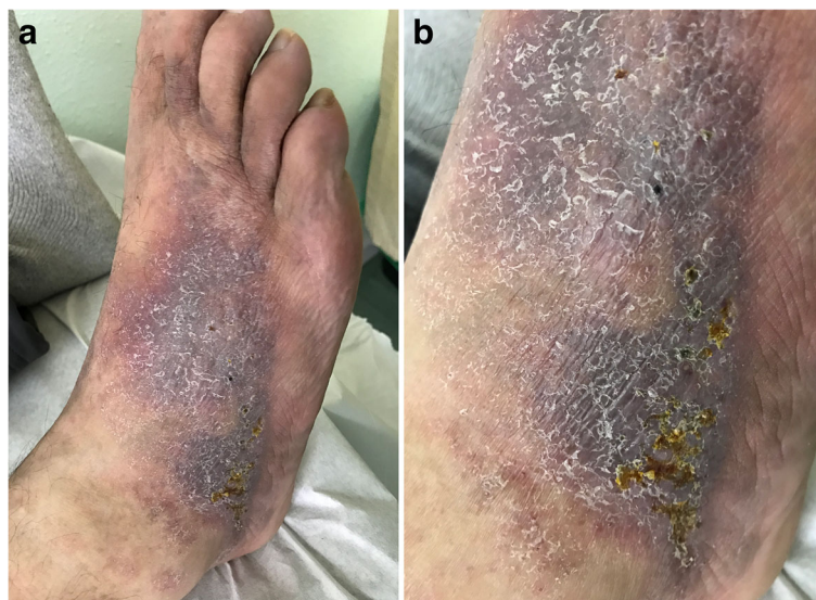
Fig. 1 The patient's right foot before MSC treatment. Prior to intravenous allogeneic MSC sequential infusions, trophic changes and multiple punctate ulcers were visible in the patient's right foot (a). Close-up view of the right foot dorsum (b)

In the patient's situation, no therapeutic alternatives were available to stop the progression of trophic changes or irrepressible pain, so ongoing clinical worsening could