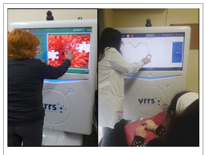
FIGURE 2 | The VRRS system: the Italian Telerehab tool used for both motor and cognitive rehabilitation.

Currently, in Italy, some health care centers use telerehabilitation for provision of health services. In particular, Bramanti et al.