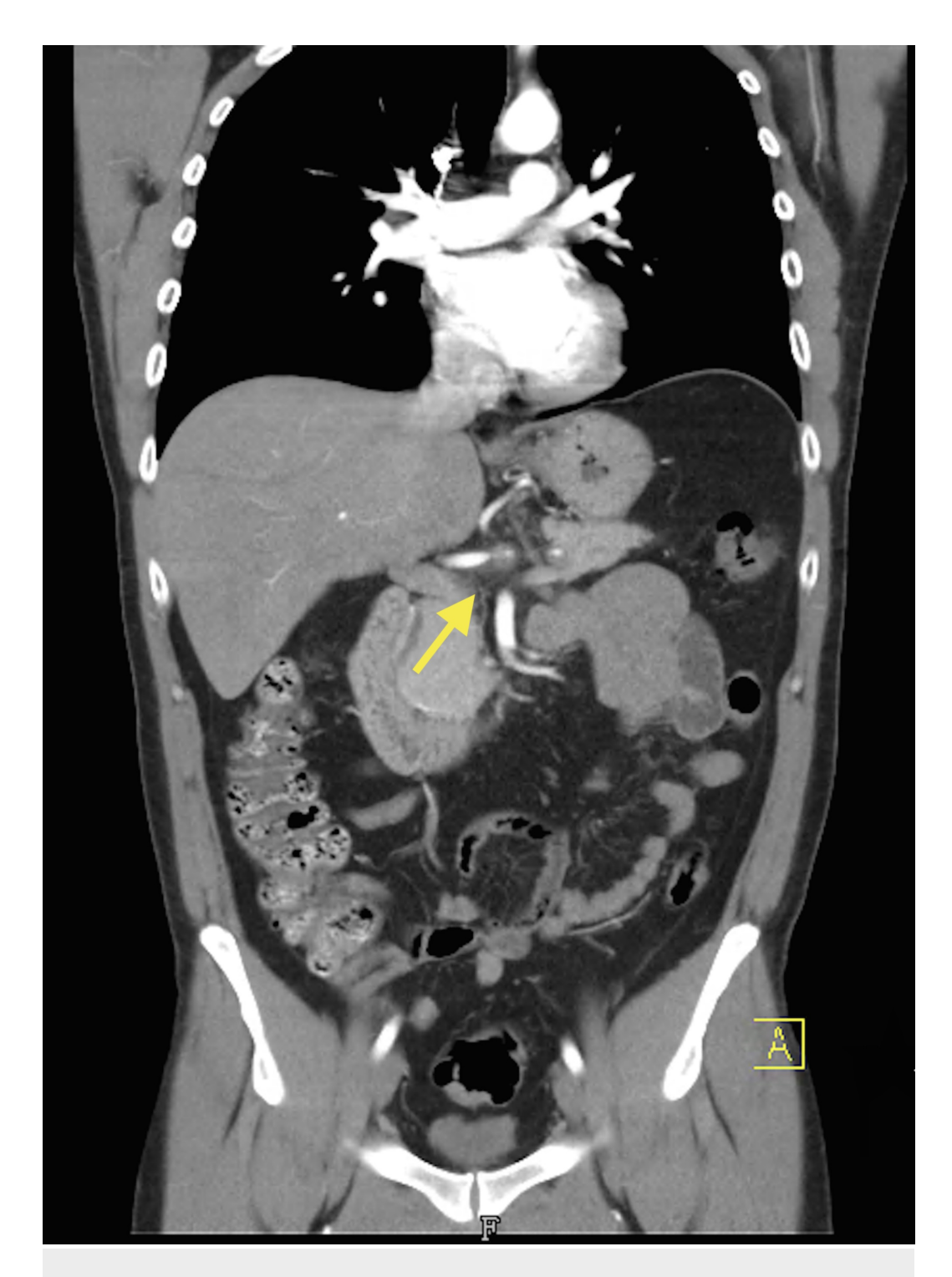
FIGURE 3: Coronal computed tomography angiography (CTA) of the abdomen and pelvis depicting celiac artery dissection with proximal hepatic artery stenosis (arrow)