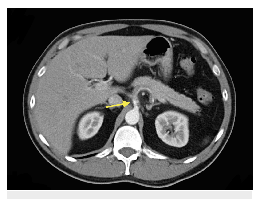
FIGURE 1: Computerized tomography (CT) of the abdomen and pelvis with contrast showed focal dissection of the celiac artery (arrow)

enhancement of the spleen was seen which may have been related to diminished flow or areas of splenic infarction (Figure 1).