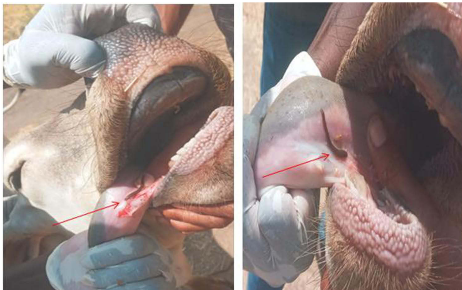
Figure 2 Leech attached on the tongue of cattle (see the arrow).

This study shows that Hirudiniasis is an indispensable disease and a potential problem to the health and productivity of livestock in the Mirab Abaya district of Southern Ethiopia. It had an overall prevalence of 13.54%. The present result is in agreement with previous reports of 11.41% by Negm-Eldin et al, 31 from livestock farms in the Green Mountain area of