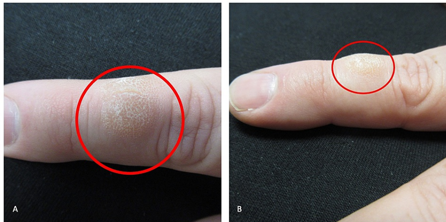
FIGURE 2: Skin biting resulting in a nodule on the dorsal left second digit

A distal view of the fingers on the dorsal left hand of a 41-year-old man. The left index finger shows an asymptomatic 12 x 12 millimeter scaly hyperkeratotic nodule (red oval) between the knuckles of his proximal and distal interphalangeal joints.