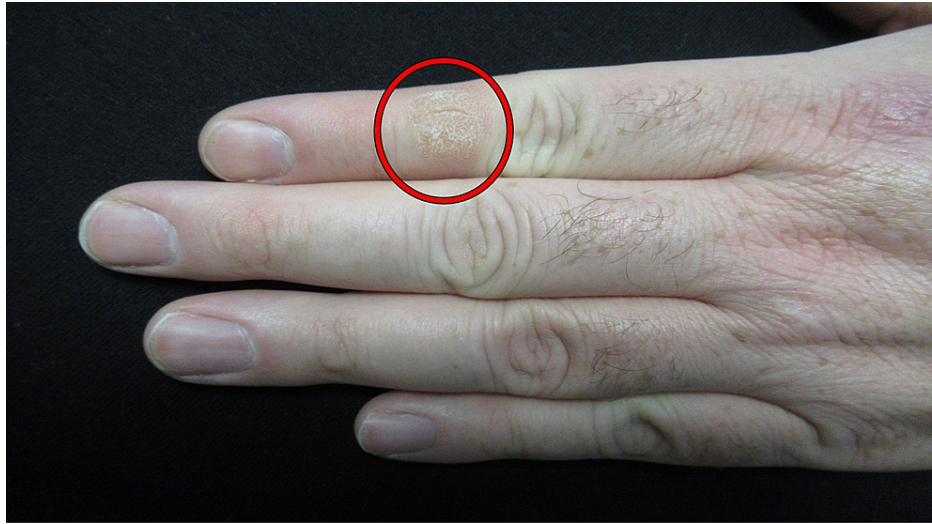
FIGURE 1: Dermatodaxia presenting as a digital nodule

A distal view of the fingers on the dorsal left hand of a 41-year-old man. The left index finger shows an asymptomatic 12 x 12 millimeter scaly hyperkeratotic nodule (red oval) between the knuckles of his proximal and distal interphalangeal joints.