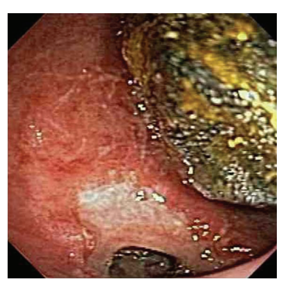
FIGURE 3: Fistula and surrounding ulceration of the duodenum on endoscopy.

and subsequent passage of gallstones via the fistula can then result in gallstone ileus [7].