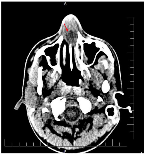
Figure 1 Non-contrast axial computed tomography (CT) image showing swelling of the nasal septum with hypodense fluid collection (red arrow).