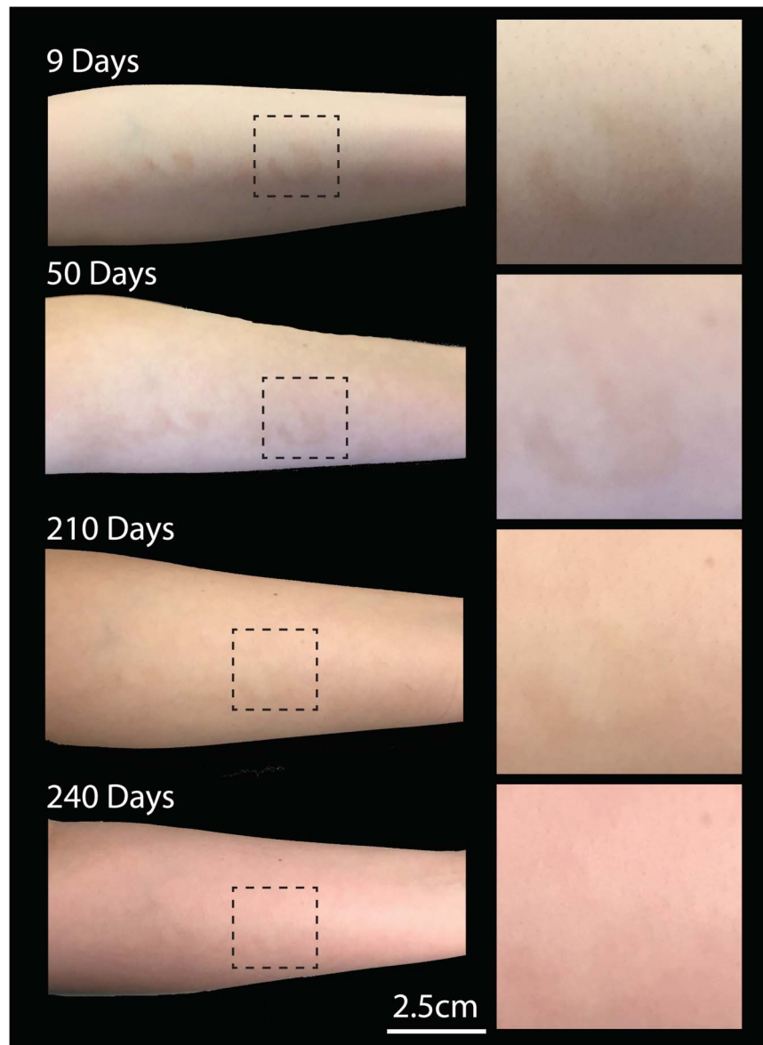
Figure 2. Case example of postinflammatory hyperpigmentation. Case subject reported persistent skin pigmentation that was first noticed 9 days after end of experiment. Subject showed pigmentation on both the left and right (not shown) forearms on all 3 stimulation sites per arm. Dotted box is centered on the same stimulation site for photographs taken on days 9, 50, 210, and 240 after the end of the experiment. Dotted box area is enlarged to the right of each image to show example hyperpigmentation and the gradually lightening of hyperpigmentation with time.

240 days after testing and without any therapeutic interventions, dark macules had faded to visible but near-normal pigment macules.