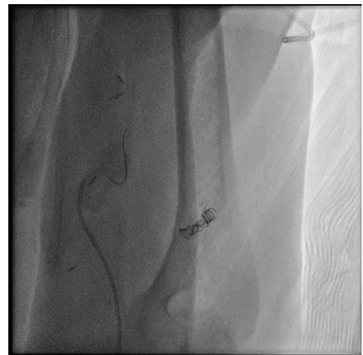
FIGURE 2 Navigation of the Arteriovenous Fistula Using a Coronary Wire

exchange-length 0.035-inch J wire failed due to redundancies in the venous segment of the AV fistula preventing catheter advancement. The 0.035-inch guidewire was exchanged for the 0.014-inch coronary wire; advancement of the guide catheter using the balloon-assisted tracking (BAT) technique (1) with