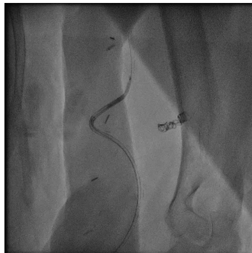
FIGURE 4 Balloon-Assisted Tracking Was Used to Navigate the 5-F Guide Catheter Through the Arteriovenous Fistula

Transradial access (TRA) for coronary angiography and PCI has become the preferred approach for many operators worldwide. TRA is considered the standard of care in the management of acute coronary syndromes in Europe (2) and a recent scientific statement published by the American Heart Association