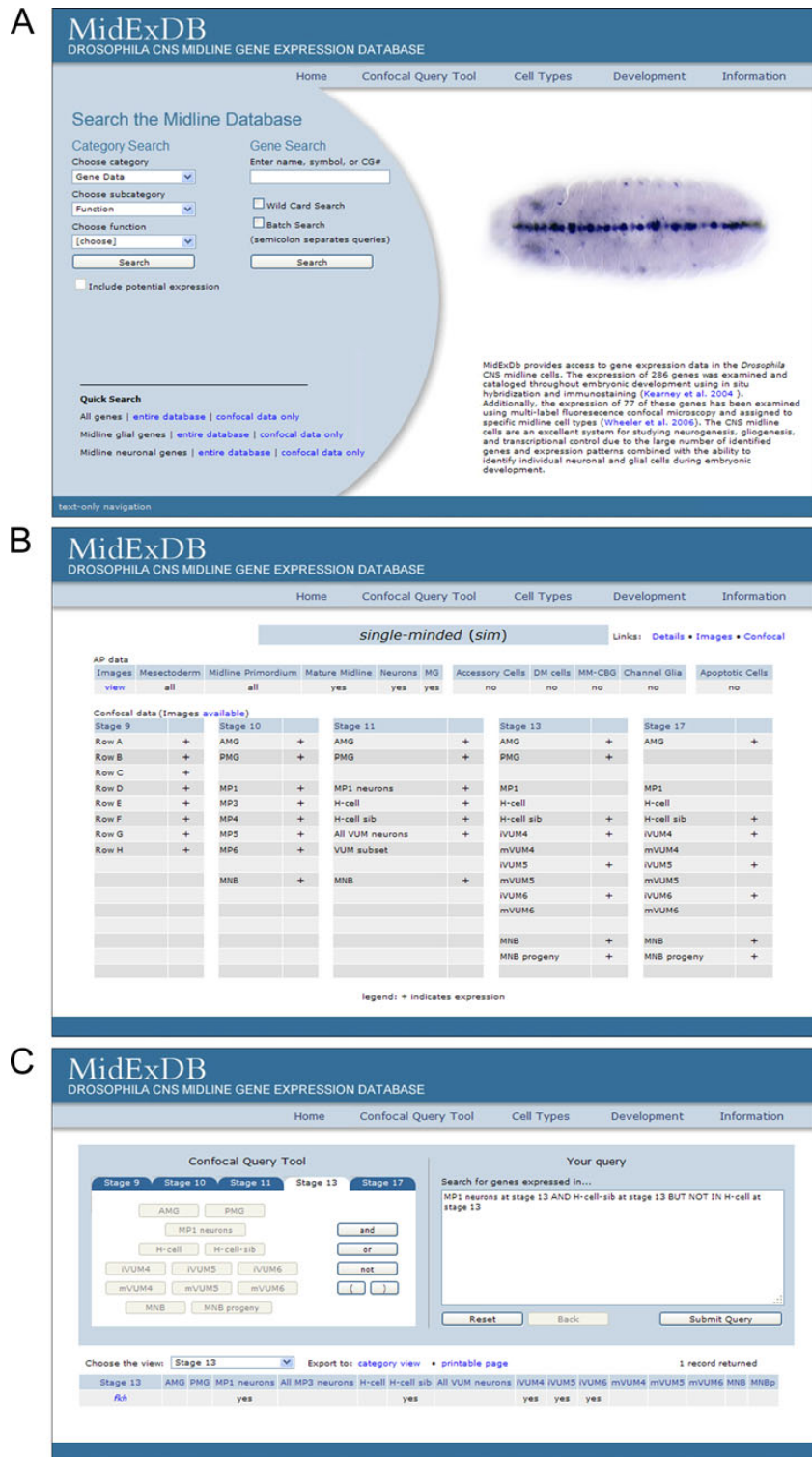
Figure 2 MidExDB search modes. (A) MidExDB Home page showing Category Search, Gene Search, and Quick Search. (B) Results of the Confocal view for the sim gene indicating its expression (+) at 5 stages of development. (C) Results from the Confocal Query Tool. The query is indicated on the right with the results listed below, showing that only the fkh gene matched the query.