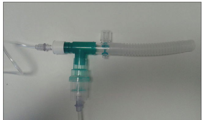
Figure 2: T-connector attached to T-piece nebulization chamber