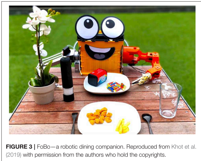
FIGURE 3 | FoBo—a robotic dining companion.