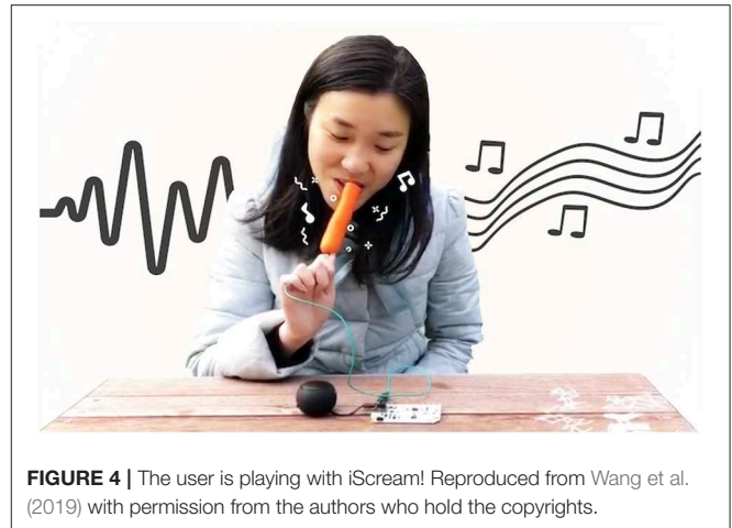
FIGURE 4 | The user is playing with iScream! Reproduced from Wang et al. (2019) with permission from the authors who hold the copyrights.

Auditory feedback can be used to change the perceived texture of food, altering the overall experience of eating, say, crisps (Zampini and Spence, 2004; Koizumi et al., 2011). Wang et al. (2018) propose a five-keys framework for augmentation of the eating experience with sounds. According to them, (1) new sounds can be generated (that are different from the natural sounds of consumed food), (2) the natural sounds can be amplified, (3) removed, or (4) blended with other (food related) sounds. Finally, the sounds can also be (5) distorted. Within this framework, the authors propose the Singing Carrot, a platform for the exploration of food sonifications, which generates sounds when the user eats a carrot. The system detects food consumption through capacitive touch sensing, and the value of sensed capacitance is mapped to the frequency of a sinewave, resulting in eating sound that dynamically changes. A similar concept is used in the iScream! system (Wang et al., 2019, see Figure 4 ), which allows the use of a novel "gustosonic" experience of digital sounds which are automatically created as a result of eating an ice cream. It also uses capacitive sensing to detect eating actions, and based on these actions, it plays different sounds to create a playful eating experience.