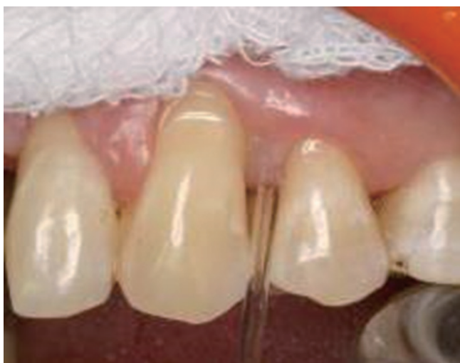
Figure 1. Collection of gingival crevicular fluid sample by using a microcapillary pipette.

A blinded trained single periodontist (V.V.M) recorded all the clinical parameters and was calibrated for probing to a senior clinical researcher (D.S.M) before the study. Examiner calibration was considered effective for an interclass correlation coefficient of \geq 0.9 . For each patient, the plaque index (PI) [17], gingival index (GI) [18], and sulcus bleeding index (SBI) [19] were recorded for all teeth, whereas the probing depth (PD), clinical attachment level (CAL), and gingival recession (GR) were considered only for the selected sites. At the selected tooth, probing was done at six sites.