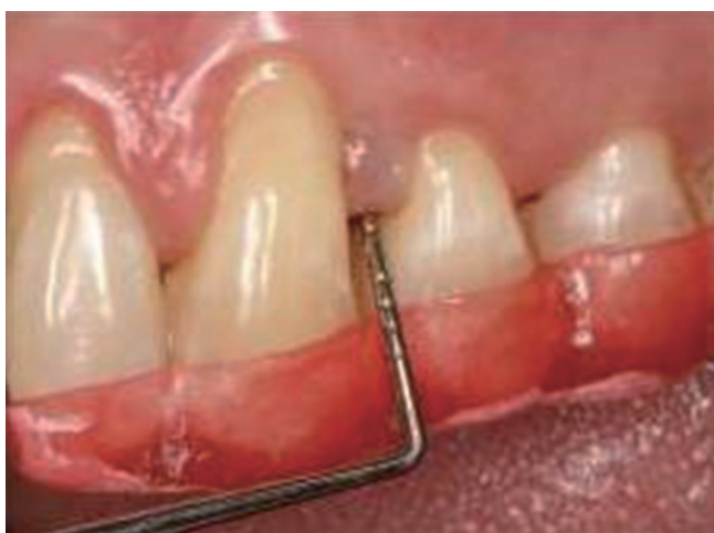
Figure 2. Measurement of the clinical attachment level by using a customized acrylic stent.

The sites that showed the deepest PD and the greatest CAL were chosen, and the same site was considered during follow-up visits. PD and CAL were measured with William's periodontal probe by using a customized acrylic stent. The lower border of the stent was used as the reference point for the CAL measurements (Fig. 2).