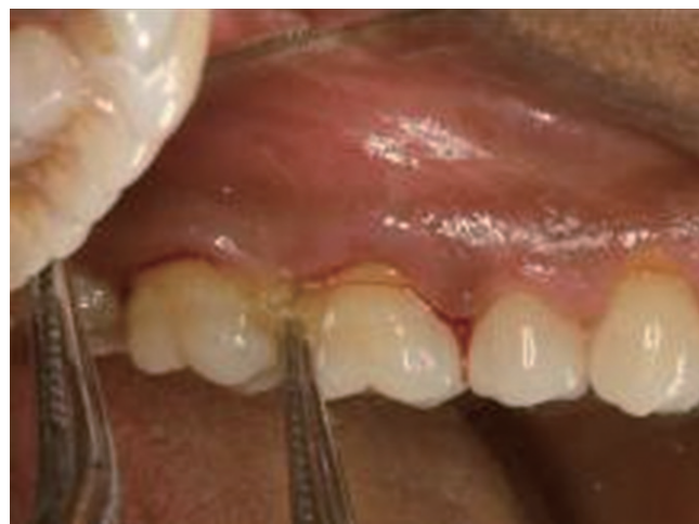
Figure 3. Local drug delivery for group III site. Group III: sites treated with scaling and root planing and local drug delivery.

The assay was performed by using BioSource Leptin-EASIA Kit (BioSource Europe S.A., Nivelles, Belgium) according to the manufacturer's instructions. It employed a quantitative sandwich enzyme immunoassay technique. The monoclonal antibody specific for leptin had been precoated onto the wells of the microtitre plate. Calibrator solution and GCF samples were pipetted into the wells, and the leptin present in the sample was bound to the immobilized antibody. After washing away the unbound substances, an enzyme-linked polyclonal antibody specific for leptin was added to the wells. Following a wash to remove the unbound antibody-enzyme reagent, a chromogenic solution was added to the