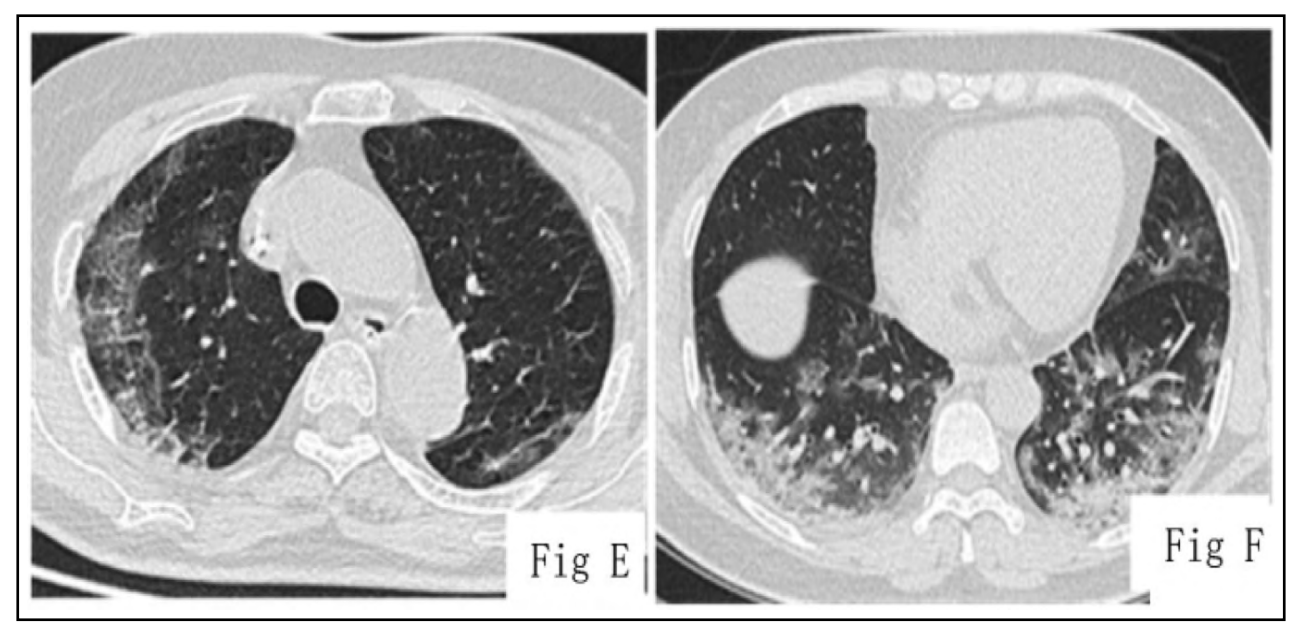
Fig.1E: COVID-19 (critical type), male, 79 years old, with the visibility of band-like high-density shadows at the subpleural regions of the upper lobes of both lungs, parallel to the pleura, and with the presence of interlobular septal thickening in the lesions, showing a crazy-paving sign-like change.

Fig.1F: COVID-19 (critical type), female, 50 years old, with the visibility of multiple GGO and consolidation in both lungs, as well as air bronchogram sign in the lesions.