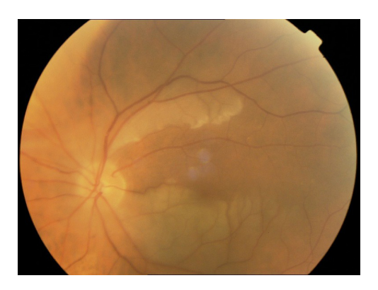
Figure 2 Fondus oculi-shows a more advanced stage of the ilness, where pailness of the optic disc and extended ischemic areas.

We also conducted blood coagulation tests, which showed an increase in fibrinogen (830 mg/dL; reference range, 200-400 mg/dL); an optical coherence tomography was required, and an electrocardiogram performed, which showed incomplete right bundle branch block. On the basis of a hematological consult, nadroparin calcium 0.6 was administered subcutaneously every 12 hours and 100 mg aspirin per day. It was also recommended that the patient be admitted to the ward for examination and treatment. On admission, the blood tests showed an ESR of 67 mm/hour (normal value < 35 mm/hour), CRP 19.4 mg/dL (normal value < 1 mg/dL). Screening for thrombophilia showed heterozygous mutation of the prothrombin G20210A and heterozygous for methyltetrahydrofolate reductase (MTHFR C677T) mutation. An ultrasound of the neck vessels and an echocardiographic examination showed no significant alterations. During hospitalization, the patient was also subjected to retinal fluorescein angiography, was visited by an internist and by a cardiologist, and underwent a complete eye examination. Following the suggestion of the immunologist, a biopsy of the temporal artery was scheduled and carried out (5 cm in length). The histological examination showed an