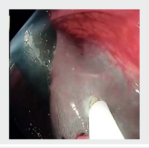
Video 1 Snare shape depending on pressure and an example of the procedure.

▶ Fig.2 Snare shape depending on amount of pressure on the anchoring point. The snare is oval without pressure on the tip (a) and becomes round when a pressure is applied to the tip (b).