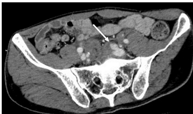
Fig. 1. Contrast-enhanced CT shows presacral hematoma and extravasation of contrast medium in the left common iliac vein (arrow). No obvious pelvic fracture or intraabdominal organ damage is observed.

Deep vein thrombosis remains a significant concern in patients with vascular trauma, particularly in venous injury [2]. In this case, we did not administer an anticoagulant because of the risk of rebleeding. In reports of conservative treatment, pharmacological prophylaxis was performed and no bleeding complications were encountered [3]. Although deep vein thrombosis was not observed in