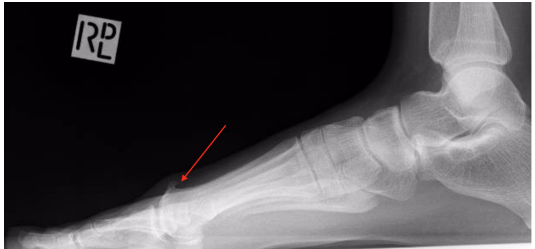
FIGURE 2: Lateral x-ray showing the dorsal osteophyte formation overlying the head of the first metatarsal.

The patient was positioned supine on the operating table. After general anaesthesia was achieved, the right foot and leg were draped in the typical fashion to facilitate a sterile field. A 15 mL 0.75% ropivacaine hydrochloride/1 mL (4 mg) dexamethasone sodium phosphate injection first metatarsal Mayo block was administered. A dorso-medial longitudinal incision followed by anatomic dissection and haemostasis was used to access the first MTPJ. Severe chondromalacia and a full-thickness osteochondral defect were noted on the articular surface of the first metatarsal head (Figure 3). A power burr was employed to perform a radical dorsal, lateral and medial exostectomy (cheilectomy) to the metatarsal head (Figures 4, 5), and a modified Valenti osteotomy was performed to the base of the hallucal proximal phalanx until 90 degrees of dorsiflexion and smooth first MTPJ range of motion was achieved.