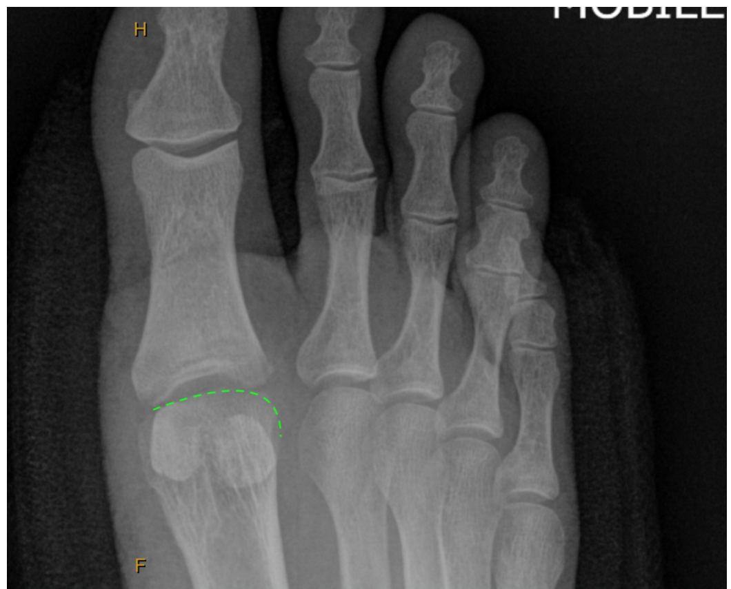
FIGURE 7: Immediate postoperative anterior/posterior radiograph showing normal metatarsal head morphology when