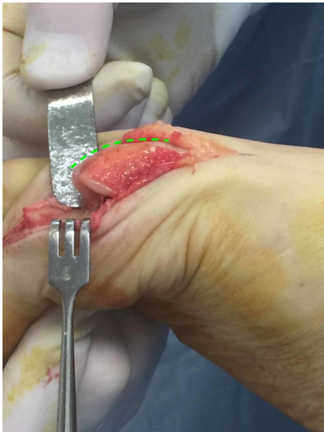
FIGURE 5: Lateral view showing the extent of the radical metatarsal head remodelling. The green line shows the parabola required to facilitate smooth joint motion and 90 degrees of dorsiflexion.

Layered wound closure was performed with a 2/0 Vicryl capsulorrhaphy and skin closure with a 3/0 running subcuticular suture. The foot was then dressed with modified-Jones compression dressings and fitted with a Darco postoperative shoe.