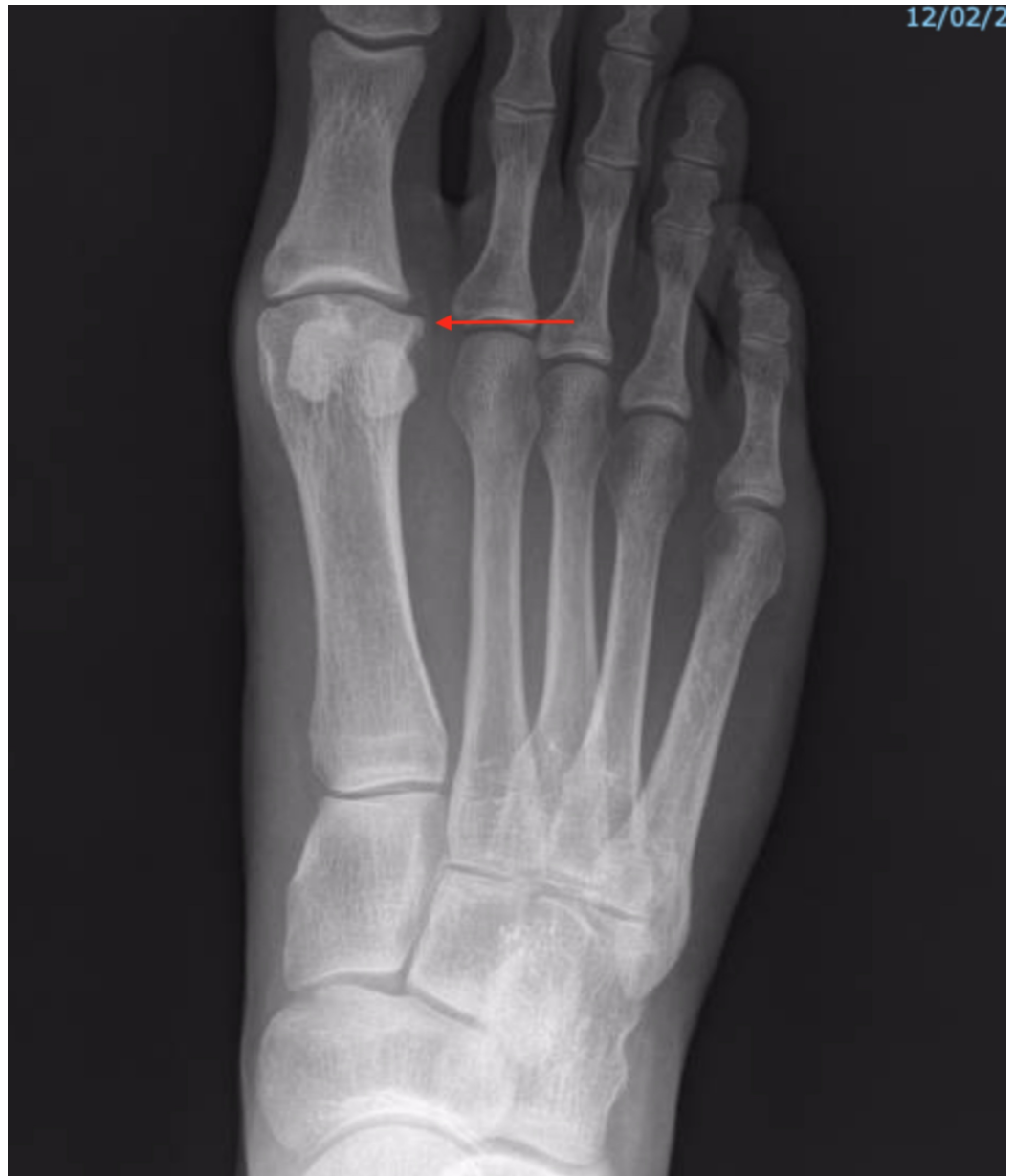
FIGURE 1: Anterior-posterior preoperative x-rays showing moderate degenerative changes of the first metatarsophalangeal joint (MTPJ).

Anterior-posterior (Figure 1) and lateral (Figure 2) projectional radiographs (X-rays) exhibited moderate right first MTPJ degenerative joint changes with a hallux abductus angle of 15 degrees and a sesamoid position of 4.