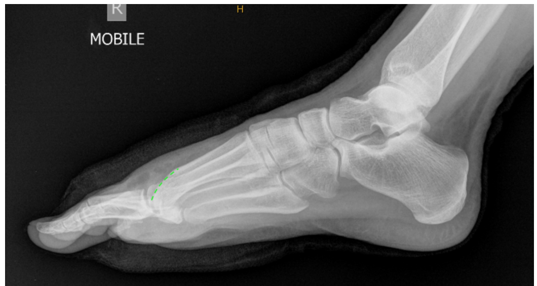
FIGURE 6: Immediate postoperative lateral radiograph illustrating the remodelled metatarsal head parabola.

the remodelled metatarsal head parabola allowing 90 degrees of dorsiflexion. The anterior/posterior radiograph (Figure 7) showed normal anatomic contours when compared to the preoperative image.