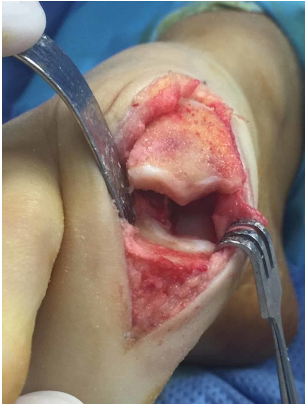
FIGURE 4: Coronal view of the radical cheilectomy showing the extent of the metatarsal head remodelling.