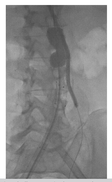
Fig 3. Kissing balloon angioplasty at the neck of the aneurysm and the chimney stent grafts into the inferior mesenteric artery (IMA).

advanced (Medtronic Cardiovascular, Santa Rosa, Calif) to the level of renal arteries. Once deployed, the graft was extended with a 16 \times 10 iliac limb into the common iliac artery. In addition, a 5 \times 150 Mustang balloon dilatation catheter (Boston Scientific, Marlborough, Mass) was advanced into both stents to perform kissing balloon angioplasty with a Coda balloon (Cook Incorporated, Bloomington, Ind). A balloon-expandable graft stent rather than a self-expandable graft stent was used to allow greater deployment control and precision. The completion