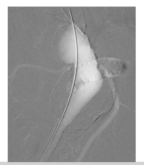
Fig 2. Lateral angiogram with CO_2 demonstrating the abdominal aortic aneurysm (AAA) and a large inferior mesenteric artery (IMA).

advanced (Medtronic Cardiovascular, Santa Rosa, Calif) to the level of renal arteries. Once deployed, the graft was extended with a 16 \times 10 iliac limb into the common iliac artery. In addition, a 5 \times 150 Mustang balloon dilatation catheter (Boston Scientific, Marlborough, Mass) was advanced into both stents to perform kissing balloon angioplasty with a Coda balloon (Cook Incorporated, Bloomington, Ind). A balloon-expandable graft stent rather than a self-expandable graft stent was used to allow greater deployment control and precision. The completion