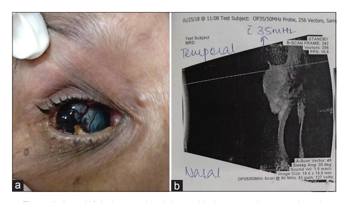
Figure 1: (a and b) A pigmented and elevated lesion measuring approximately 0.8 cm × 0.8 cm, in the right eye encroaching over conjunctiva and cornea along with hazy corneal opacity, suggestive of cataract. (b) B-mode ultrasound revealed an eyelid and conjunctival lesion (? melanoma) with encroachment on cornea of the right eye

were round to oval to spindle-shaped with central to eccentrically placed nuclei, coarse chromatin, prominent inclusion-like nucleoli, and moderate amount of cytoplasm [Figure 2c and d]. Intracellular and extracellular blackish-brown pigment (melanin) was seen at places [Figure 2a-d]. Many binucleated, multinucleated, and bizzare forms were also noted [Figure 2a-d].