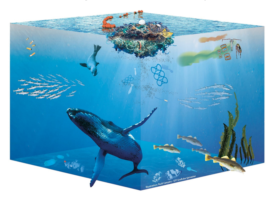
Figure 4. Plastic as a wicked problem, affecting the marine ecosystem as a whole. Illustration by Rudi Caeyers for SECURE, UiT Grafiske tjenester, 2021.

g. Be constructed following the systems thinking approach and therefore develop multiple interconnections to the SDGs in the Agenda 2030 [47,48].