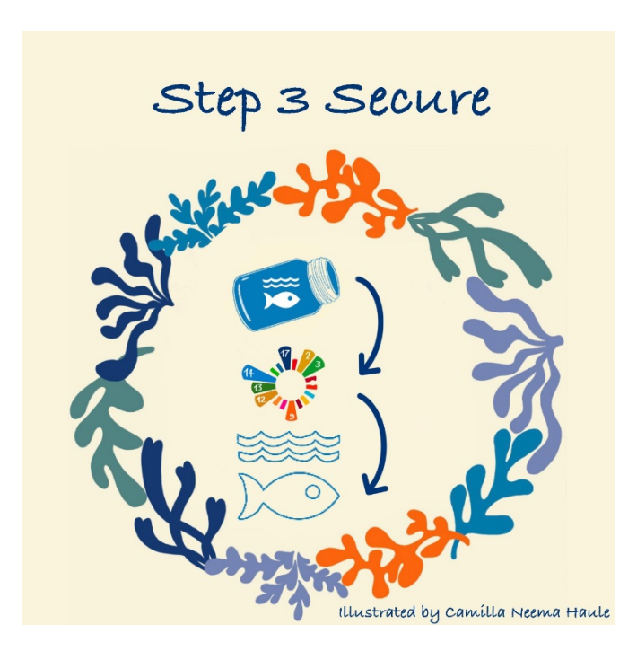
Figure 3. The systematic approach of the Agenda 2030 applied to ocean plastics: overcoming loopholes in regulation through a multilevel governance system applied to the SDG 14, on Life Below Water [41,42]. Illustration by Camilla Neema Haule for SECURE 2021.