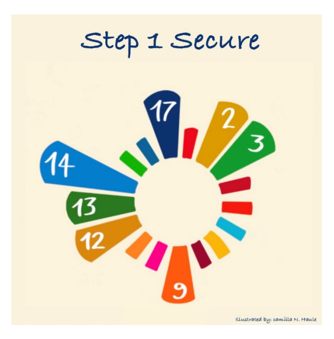
Figure 1. Illustration of Step 1 of the Project SECURE [41], representing the need to tackle novel marine resources through a systematic approach of the Agenda 2030 (with a main focus on SDG 14, on Life Below Water). Illustration for SECURE by Camilla Neema Haule 2021.

The first leg of the project focuses on the need to develop a matrix that conceptually encompasses the objectives of the Agenda 2030 and its 17 SDGs from a regulatory perspective on the one hand, and allows the upscaling of climate-smart practices applied to the ocean—as it is the case of the SECURE, on the other hand (Figure 1) [41]. The observed lack of a systematic mapping of the SDGs' interactions and the dearth of climate-smart practices applied to the ocean spurred reflections on the need to create a critical conceptual framework as a reading key for the SDGs' interactions and for upscaling successful climate-smart practices [41]. The application of a matrix based on systems thinking within a legal fabric opened the door to reflections about integrated regulatory approaches applied to the ocean.