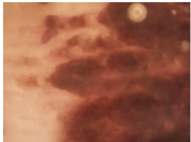
Figure 1. Nailfold videocapillaroscopy of the patient: strong suspicion of systemic sclerosis in the active stage with enlarged capillaries and capillary loss with pericapillary hemorrhages.

During this first test, DROPmin was -35 mm Hg on the left limb. The MWD was 118 m, and walking was stopped because of left limb pain corresponding to the usual symptoms (Fig. 2, right upper panel). Then, tcpO 2 confirmed exercise-induced left limb ischemia. We decided to add a PDE-5i Sildenafil (20mg tid) because of active digital ulcers. [3] A new tcpO 2 test on treadmill after 17 weeks showed an MWD of 288 m (+144%). DROPmin