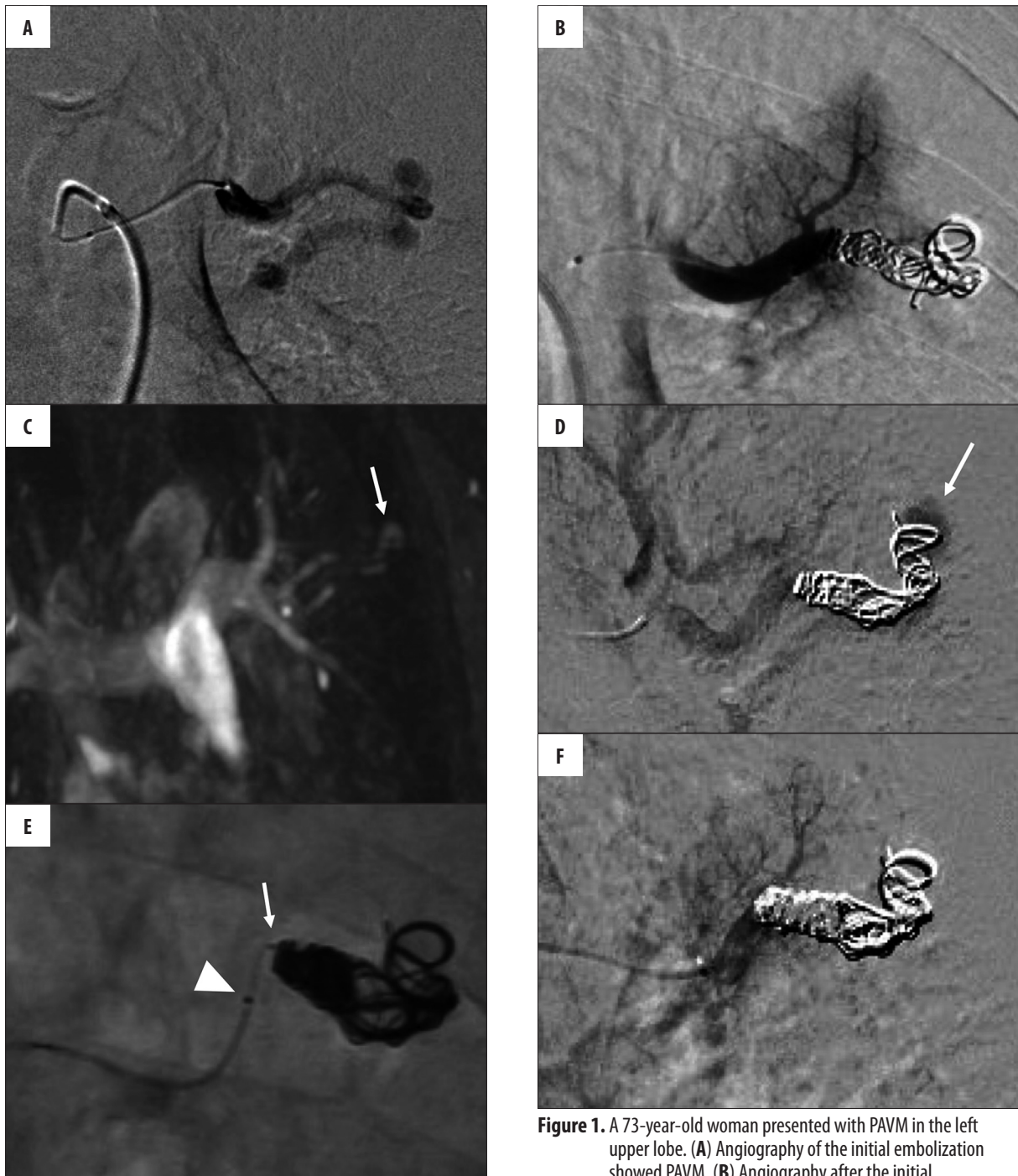
Figure 1. A 73-year-old woman presented with PAVM in the left upper lobe. (A) Angiography of the initial embolization showed PAVM. (B) Angiography after the initial embolization revealed that PAVM was completely embolized using coils. (C) Contrast-enhanced MRI performed 42 months after the initial coil embolization showed recanalization (arrow). (D) Angiography before re-embolization showed recanalization. (E) Coil embolization was performed using the triaxial system. The 1.9-Fr. no-taper microcatheter (arrow) could be inserted into the original coils with good support from the 2.7-Fr. microcatheter (arrow head). (F) Angiography after re-embolization showed a complete cessation of blood flow. The normal branch of the pulmonary artery was saved.

recently reported on the usefulness of TR-MRA in diagnosing reperfusion of PAVM after coil embolization, compared with CT. That is why that technique was used to detect recanalization in our hospital.