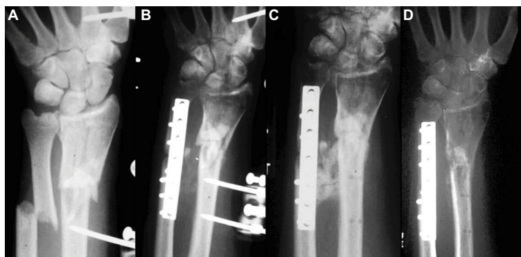
Figure 2 (A) Patient sustained open fractures of both bones and was placed in an external fixator; (B) early formation of synostosis; (C) fully mature synostosis; and (D) after successful excision of the synostosis.