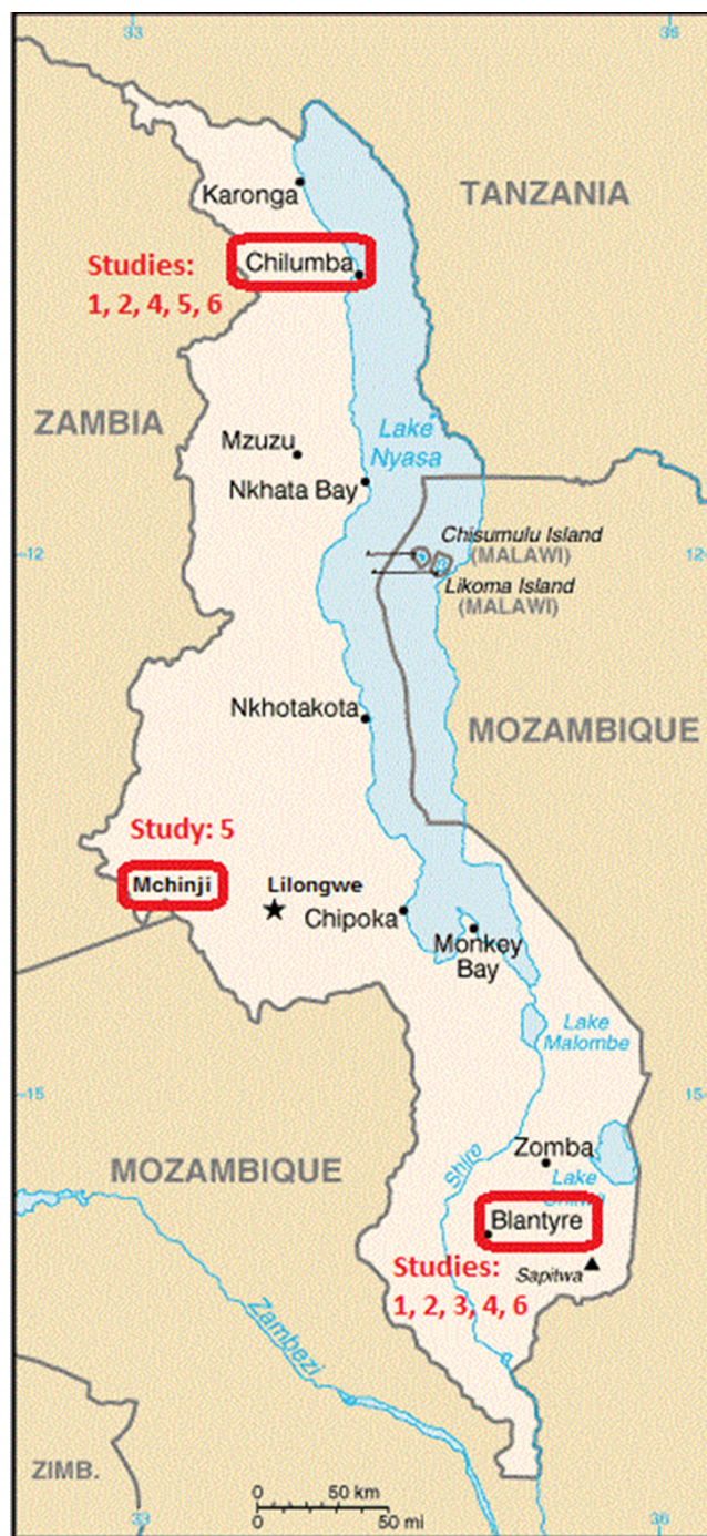
Fig. 1. Map of Malawi. Areas highlighted represent the three study sites. Studies by site: (1) Disease incidence and distributions of S. Pneumonia serotypes and rotavirus genotypes. (2) Matched case-control studies of direct PCV effectiveness against IPD and against radiological pneumonia using community controls. (3) Matched case-control study of indirect PCV effectiveness against IPD in adults living with vaccine age-eligible children. (4) Matched and unmatched case-control studies of RV1 effectiveness against severe acute rotavirus gastroenteritis using community controls and hospitalised rotavirus test-negative controls, respectively. (5) Population based cohort study to measure under-5 and post-neonatal infant all-cause and disease-specific mortality by vaccine status. (6) Cost-effectiveness studies from societal, healthcare provider and household perspectives.

Southern Malawi: The Malawi-Liverpool-Wellcome Trust Clinical Research Programme (MLW) in Blantyre has surveillance for IPD spanning 13 years [3,22], and has extensively characterised rotavirus molecular epidemiology in the pre-vaccine era [34,35]. Blantyre district numbered 1,001,984 persons at the 2008 census [32]. Queen Elizabeth Central Hospital (QECH) provides free health services and is the principal referral centre [36]. Active case finding at QECH paediatric emergency department and inpatient wards enrolls children with presumed sepsis, meningitis, acute gastroenteritis and severe respiratory illness, in whom blood culture, lumbar puncture, stool collection, chest radiography or nasopharyngeal swabs are performed per protocol. Blood culture is not