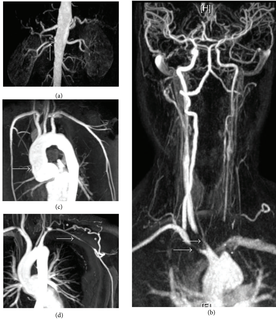
FIGURE 3: Indications for surgical intervention in Takayasu arteritis. Surgery should not be undertaken lightly in patients with TA. However, the outcome of intervention in those with serious complications is good and improved if disease activity can be controlled prior to surgery. The figure shows MRA studies. (a) A right renal artery stenosis subsequently successfully treated by percutaneous angioplasty with resolution of hypertension. (b) Severe disease of the great vessels including stenoses of the right subclavian and common carotid arteries (arrows) and occlusion of the left subclavian and left common carotid arteries (stars). The patient suffered severe cerebrovascular symptoms and underwent successful bypass surgery. (c) A dilated ascending aorta with associated severe aortic regurgitation in a young female patient who required aortic valve replacement. (d) Although patients commonly suffer claudication symptoms as a consequence of subclavian artery stenosis (arrow), these often improve following the development of collaterals (stars) as shown here, precluding the need for intervention.

aneurysms following surgery of 13.8% at 20 years [40]. Therefore lifelong regular follow-up is mandatory for these patients. The results for endovascular intervention (angioplasty and stenting) are less encouraging in comparison [23, 24]. This might in part reflect the character of the TA lesions [3]. Takayasu lesions in aortic branch vessels are frequently proximal and can render placement of a stent difficult. The lesions are often long, irregular, and fibrosed, thereby predisposing to restenosis. Good results are seen in the treatment of short focal stenosis in the presence of inactive disease [41, 42]. Surgical treatment had a better outcome compared to endovascular intervention in terms of postoperative complications (37.5% and 50%, resp.) [24]. Cong et al. echo this, where restenosis occurred in 34.7% of surgical bypasses and