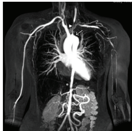
FIGURE 1: Magnetic resonance angiography in Takayasu arteritis. Contrast-enhanced magnetic resonance angiogram revealing the extent of arterial disease in a young woman with Takayasu arteritis. The left subclavian artery is occluded (arrow) and this has led to collateral formation. There is a long stenosis in the left common carotid artery (arrowhead). The lower thoracic and abdominal aorta is narrow and irregular down to the aortic bifurcation (star).

Percutaneous digital subtraction radiographic angiography was previously considered the gold standard for diagnosis of