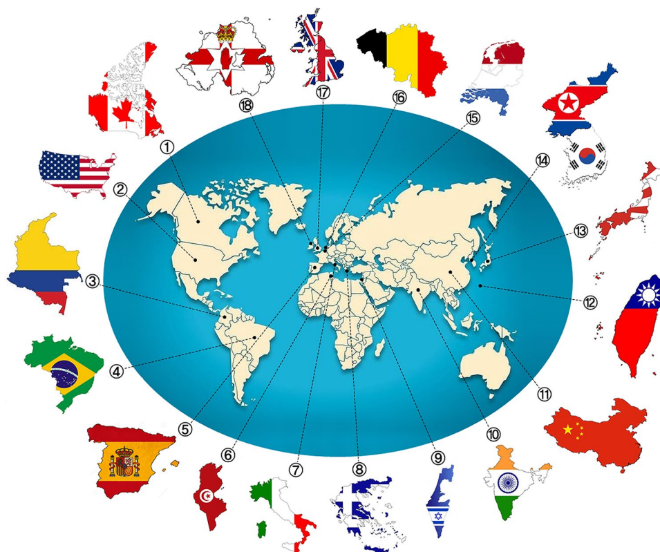
Fig. 2 Worldwide distribution of 254 reported Corynebacterium striatum cases of human infections and/or nosocomial outbreaks from year 1976 to 2020: Canada (1), United States of America (2), Colombia (3), Brazil (4), Netherlands (5), Belgium (6), United Kingdom (7), Northern Ireland (8), Italy (9), Spain (10), Greece (11), Tunisia (12), Israel (13), India (14), China (15), Korea (16), Japan (17), and Taiwan (18). Cases and/or outbreaks were reported in Europe ( n=124 ), Africa ( n=64 ), Asia ( n=36 ), South America ( n=17 ), and

North America ( n=13 ). Nosocomial outbreaks were reported in Belgium ( n=24 ), Spain ( n=21 ), Brazil ( n=14 ), Netherlands ( n=14 ), and Italy ( n=13 ). Multiple and single cases were reported in health units China ( n=1 ), Colombia ( n=1 ), Greece ( n=1 ), Netherlands ( n=1 ), Northern Ireland ( n=1 ), Taiwan ( n=1 ), Brazil ( n=2 ), Canada ( n=2 ), Korea ( n=2 ), India ( n=3 ), Israel ( n=3 ), United Kingdom ( n=5 ); Spain ( n=7 ); United States ( n=11 ); Japan ( n=26 ); Italy ( n=37 ), and Tunisia ( n=64 )