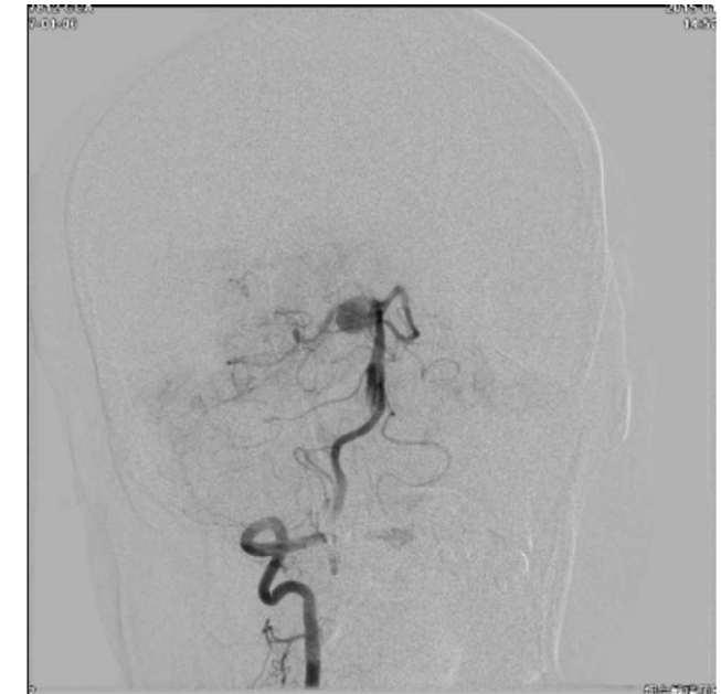
Figure 3. Right vertebroarteriography showed formation of aneurysm at the top of the basilar artery.

of stability and accuracy in finger-to-nose test with left hand, unable to complete left heel-knee-tibia test, incomppliance in Romberg Sign test and no obvious abnormality in other neurologic tests. Neck vascular ultrasound showed bilateral carotid artery atherosclerosis. Craniocerebral enhanced magnetic resonance imaging (MRI) suggested pontine infarction (fresh focus) and formation of right posterior communicating aneurysm with thrombosis. The patient received cerebral angiography which suggested that the left middle cerebral artery originated from the ophthalmic artery segment of the right carotid artery, collateral patency of the anterior communicating artery, left ICA hypoplasia, poor morphology of the basilar artery and basilar artery aneurysm (Figs. 1–3). The diagnosis was: