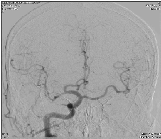
Figure 1. Right carotid artery angiography showed that the left middle cerebral artery originated from the right carotid artery segment of the right carotid artery. The anterior communicating artery was open and bilateral anterior cerebral arteries were visible.

of stability and accuracy in finger-to-nose test with left hand, unable to complete left heel-knee-tibia test, incomppliance in Romberg Sign test and no obvious abnormality in other neurologic tests. Neck vascular ultrasound showed bilateral carotid artery atherosclerosis. Craniocerebral enhanced magnetic resonance imaging (MRI) suggested pontine infarction (fresh focus) and formation of right posterior communicating aneurysm with thrombosis. The patient received cerebral angiography which suggested that the left middle cerebral artery originated from the ophthalmic artery segment of the right carotid artery, collateral patency of the anterior communicating artery, left ICA hypoplasia, poor morphology of the basilar artery and basilar artery aneurysm (Figs. 1–3). The diagnosis was: