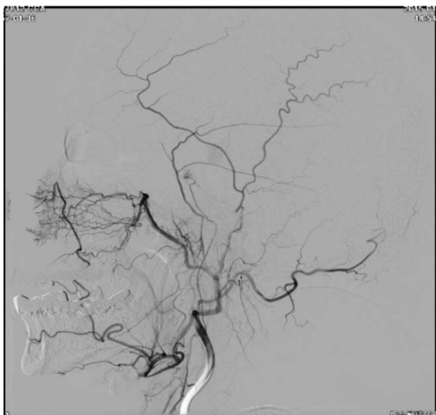
Figure 2. Left carotid artery angiography showed left internal carotid artery hypoplasia.

Most cases of CICAH can be completely asymptomatic as the patients' collateral circulation, such as the Willis' circle, is well developed. [9] Lie et al first described the 6 types of compensations of ICA circulation in CICAH patients. [10] Type A: in case of absence of unilateral ICA, the anterior communicating artery compensates to the ipsilateral anterior cerebral artery and the enlarged posterior communicating artery to the ipsilateral middle cerebral artery. Type B: the ipsilateral anterior cerebral artery and middle cerebral artery are supplied by the anterior communicat-