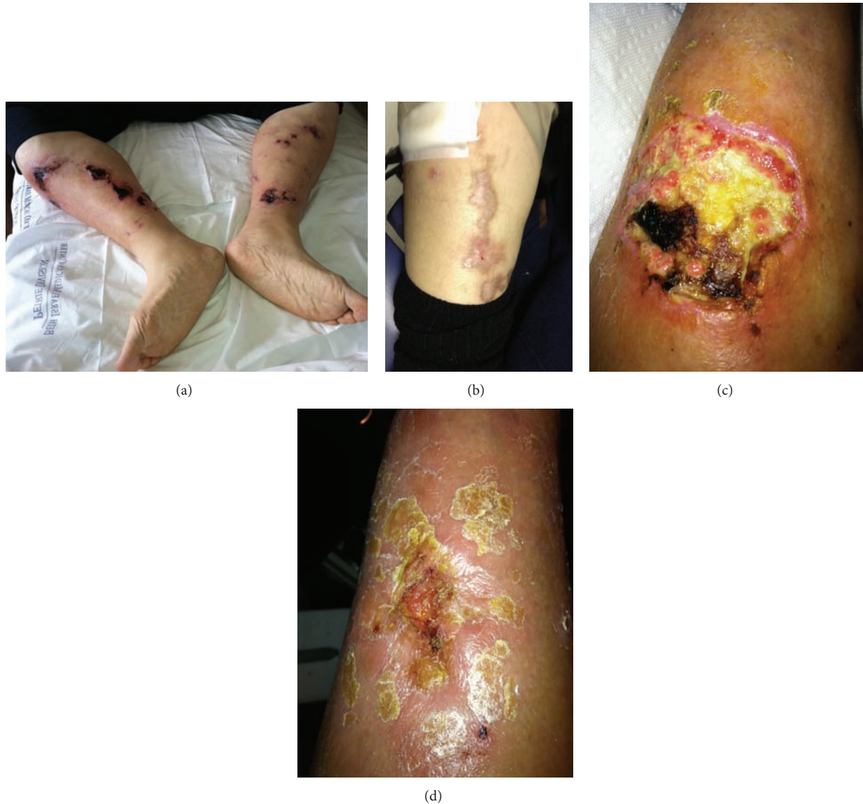
FIGURE 2: (a) Legs before treatment, (b) leg lesion after 12 weeks of treatment, (c) skin ulceration of forearm at beginning of treatment, and (d) skin ulceration of forearm after 8 weeks of treatment.