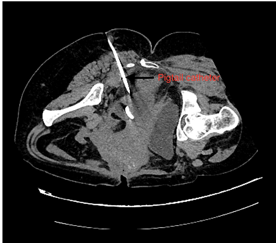
FIGURE 2: CT Scan image showing insertion of pigtail catheter after needle placement via transgluteal approach.