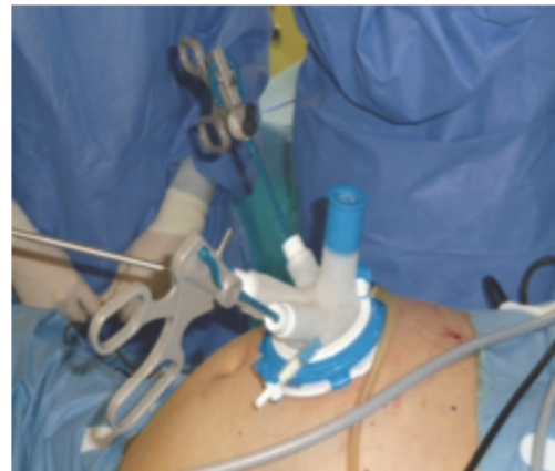
FIGURE 3: The band was cut in the stomach with scissors and removed.

The nasogastric tube and drain were removed on postoperative day 2 and the patient resumed oral dieting beginning by liquids.