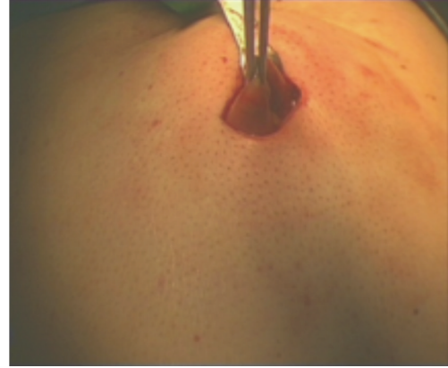
FIGURE 2: Stomach was grasped at the anterior site and brought outside the abdomen.

There were no intra- or postoperative complications.