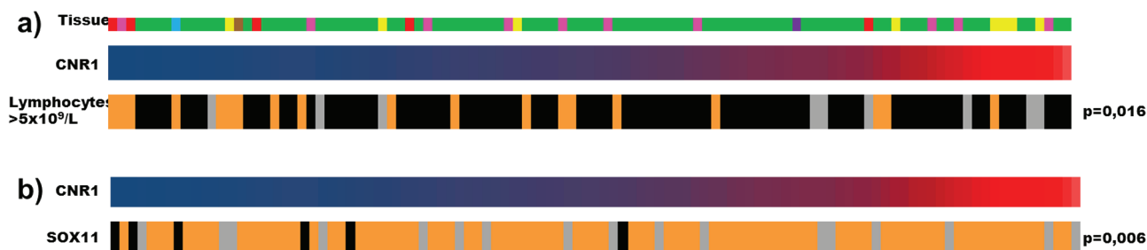
Figure 2: Graphical representation of statistical significance between CNR1 expression levels and other parameters. Tissue types in which gene expression was investigated are color-coded: green – lymph node, pink – tonsil, yellow – spleen, brown – bone marrow, purple – gastrointestinal tract, red – blood, blue – pleura. MCL cases were sorted according to increasing levels of CNR1 expression (navy blue shows the lowest expression RFI=0.63, red – the highest RFI=4652.37): a) low levels of CNR1 mRNA correlate to lymphocytosis (lymphocytes >5 \times 10^9/L ), marked in orange, grey color – data unknown; b) CNR1 mRNA levels correlate to immunoreactivity for SOX11. SOX11 positive cases are marked in orange, SOX11 negative in black, grey color – data unknown.

The ECS has attracted attention as a potential target for therapy in inflammatory disorders and cancer. A number of agents targeting various components of the ECS have been designed and tested in clinical trials [13, 15]. MCL is an aggressive disease with usually poor survival [20] and new therapeutic options are clearly needed. We here analyzed the key components of the ECS and correlated the findings to clinico-pathological characteristics of the patients. Our study shows that the ECS is heavily perturbed in MCL. NAPEPLD was highly expressed in MCL compared to non-malignant B-cells.