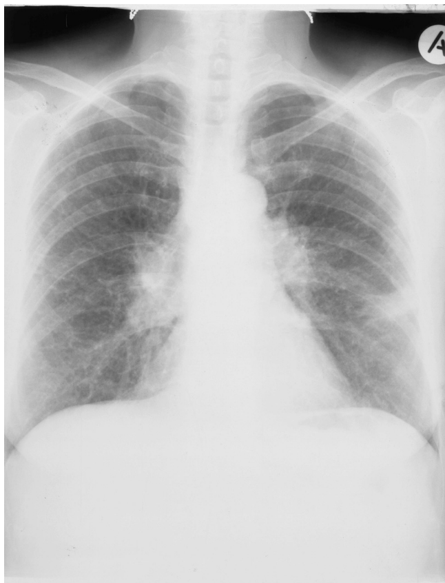
Figure 3 Chest X-ray showing extended bilateral interstitial lung densities and left lower lung field consolidation.

The patient received broad-spectrum antibiotic treatment without any response, while her dyspnea progressively increased and she was supported with oxygen therapy. A chest X-ray disclosed extended interstitial lung densities in both lungs as well as consolidation in the left lower lung field (Figure 3). As she was clinically and radiologically deteriorating, treatment with the standard anti-TB drug regimen (isoniazid 300 mg daily, rifampin 600 mg daily, pyrazinamide 2 g daily and ethambutol 1 g daily) was started in addition to prednisolone 1 mg/kg daily. The