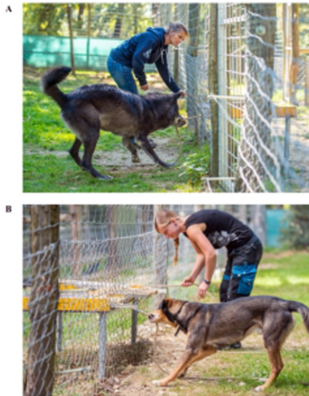
Figure 1. Illustration of a wolf (A) and a dog (B) working with a human cooperation partner.

competence 18 when interacting with them. These hypotheses predict that dogs will outperform wolves when cooperating with humans whereas based on the Canine Cooperation Hypothesis we expect that, if early and intensive socialization with humans is given, wolves can cooperate with humans as well as dogs.