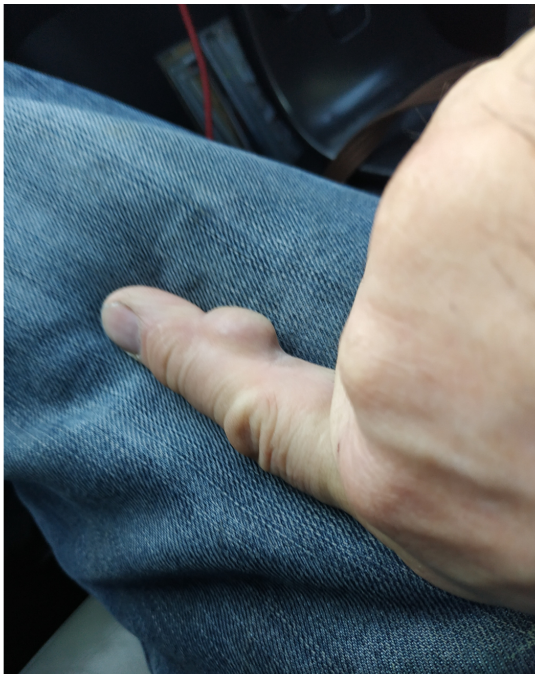
FIGURE 2: Pre-operative clinical photo 2

This had been present for over 20 years. The size of the mass was beginning to interfere with his working duties; however, there was no neurosensory deficit. He had no significant past medical history. Clinically, the lesion was consistent with a giant cell tumour. He had no axillary lymphadenopathy. A close-margin excision biopsy of the mass with some overlying skin (Figure 3) showed a dermal tumour that was lobular and partially cystic.