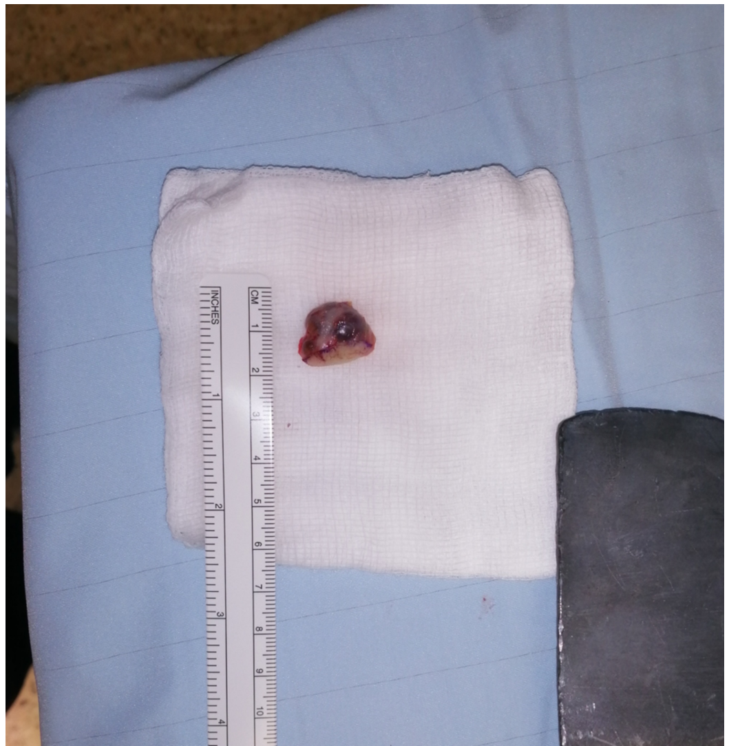
FIGURE 3: Excisional biopsy specimen

There were tubulopapillary structures with large irregular nuclei and numerous mitoses. It was diagnosed as an ADPAca. A staging positron emission tomography-computed tomography (PET-CT) scan was negative for distant metastases. Following a discussion at our institution's skin cancer multidisciplinary team meeting, it was concluded that a sentinel node biopsy was not warranted, and he subsequently went on to have a ray amputation of his index finger (Figure 4).