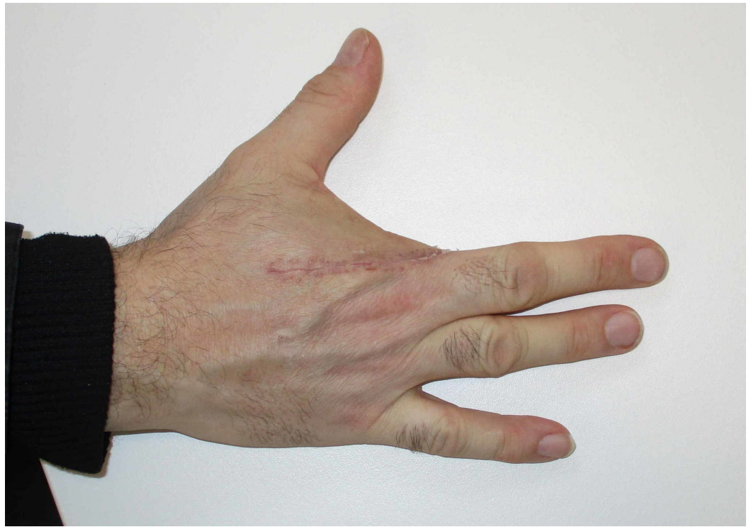
FIGURE 4: Post-operative clinical photograph

He had an uncomplicated post-operative course. Final histology showed involvement of the skin only, with the lesion widely excised (Figures 5-6).