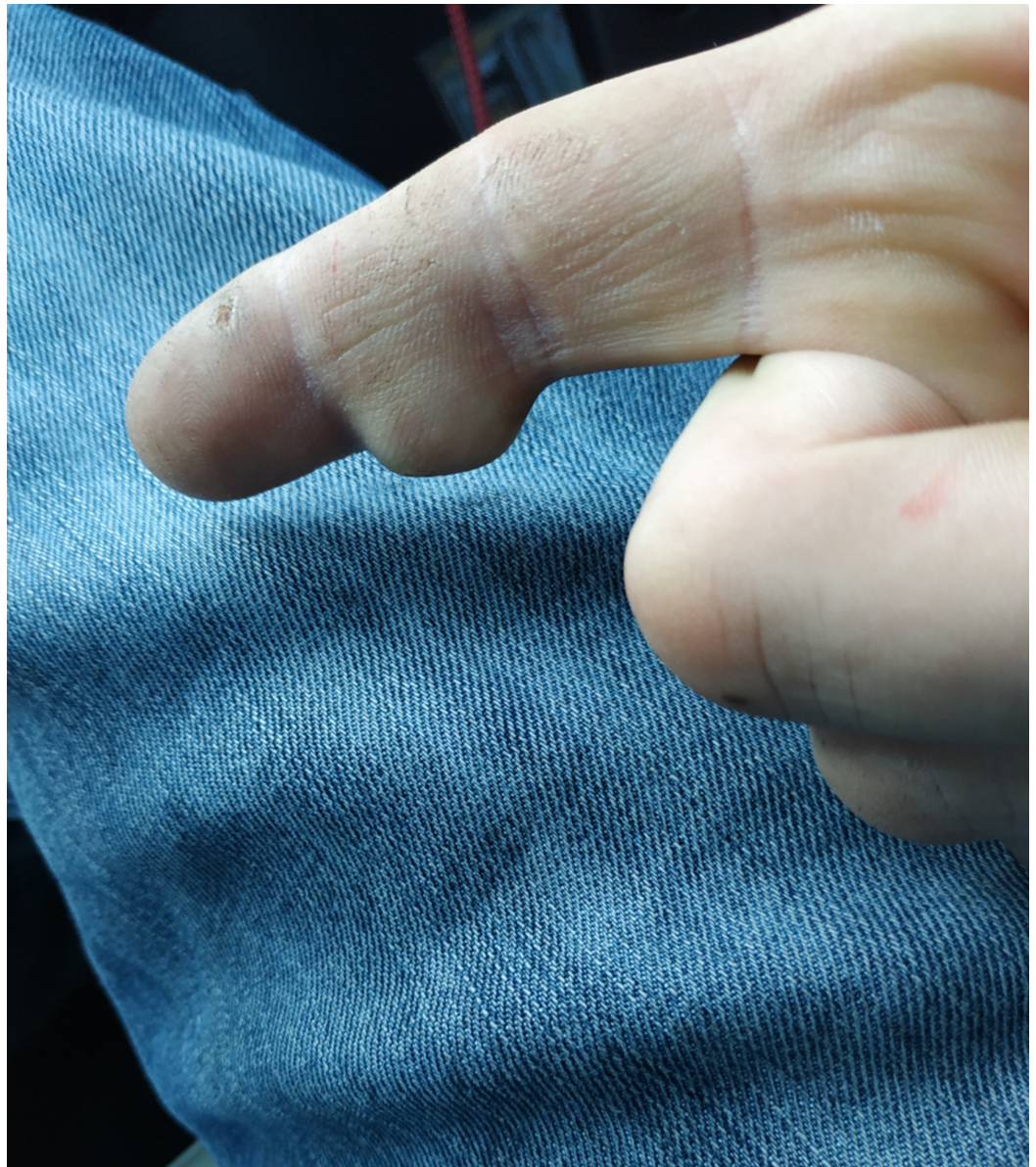
FIGURE 1: Pre-operative clinical photo 1