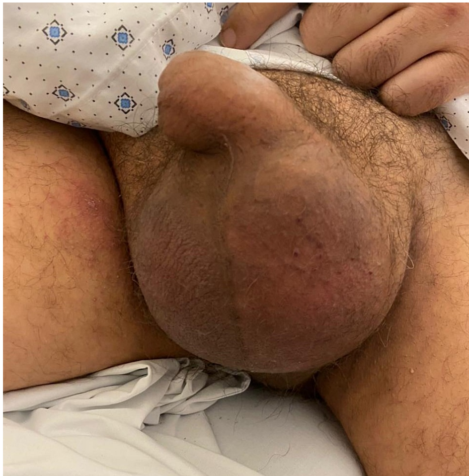
FIGURE 1: Photograph showing an enlarged, painful, and tense scrotum.

The vital signs were within normal range and the patient was afebrile. A scrotal ultrasound was done and revealed only the presence of air artifact. A CT of the chest, abdomen, and pelvis was done and it revealed a bilateral pneumoscotum (Figure 2A) and a subcutaneous emphysema, mostly at the left, extending from the thoracic wall, left flank, and abdominal wall, till the groin and the left thigh (Figure 2B). The CT of the chest also showed a left-sided pleural effusion associated with a left-sided pneumothorax (Figure 2C) and the presence of a bronchopleural fistula (Figure 3). The chest tube was in place.