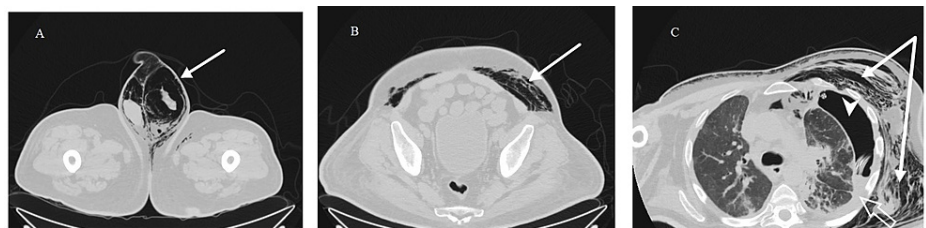
FIGURE 2: CT of the chest, abdomen, and pelvis showing the pneumoscotum, the subcutaneous emphysema, and the pneumothorax.

The vital signs were within normal range and the patient was afebrile. A scrotal ultrasound was done and revealed only the presence of air artifact. A CT of the chest, abdomen, and pelvis was done and it revealed a bilateral pneumoscotum (Figure 2A) and a subcutaneous emphysema, mostly at the left, extending from the thoracic wall, left flank, and abdominal wall, till the groin and the left thigh (Figure 2B). The CT of the chest also showed a left-sided pleural effusion associated with a left-sided pneumothorax (Figure 2C) and the presence of a bronchopleural fistula (Figure 3). The chest tube was in place.