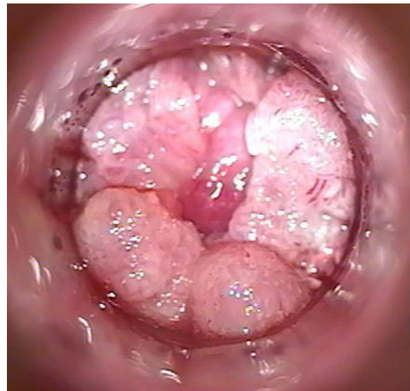
Figure 1 Before Topical 5-FU.