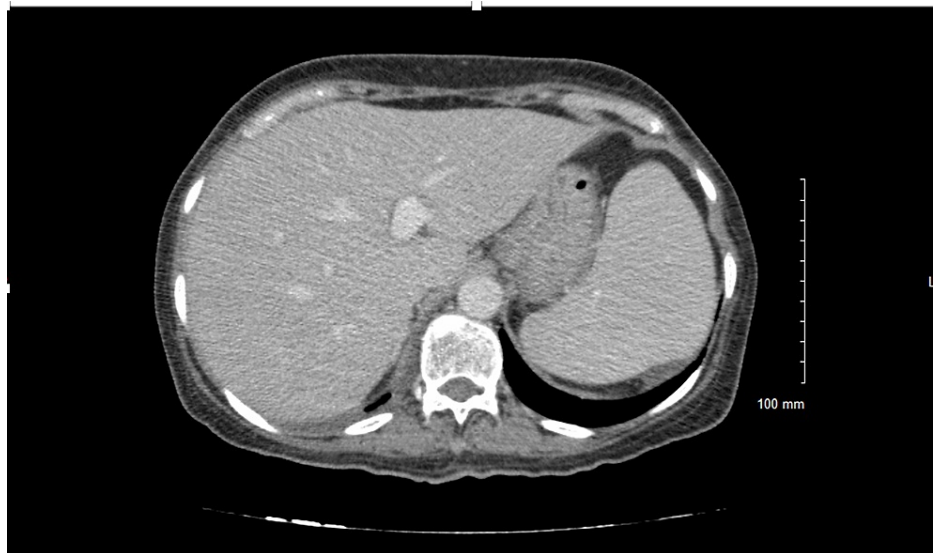
FIGURE 1: CT scan of the abdomen showing hepatosplenomegaly