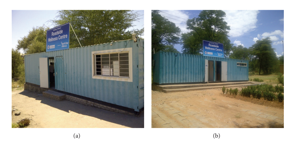
FIGURE 1: Roadside Wellness Centres in Chirundu South and Beitbridge, Zimbabwe.

a survey of truck drivers visiting sex workers at truck stops in KwaZulu Natal found an overall prevalence of 56% [13]; and, in 2011, HIV infection in long-distance truck drivers in the Niger Delta of Nigeria was estimated at 10% [4, 14]. A 2004 modelling study estimated new HIV infections at 3000– 4000 annually among sex workers and their clients (mainly truck drivers) on the major transport corridor between the port of Mombasa, Kenya, and Kampala, Uganda [15–17]. This corresponded to a high incidence estimate between 0.66 and 0.89 per 100 person/years in truck driver clients of sex workers, assuming HIV prevalence in truck drivers to be 20%, condom use frequency to be constant (78% for contacts with sex workers), and HIV prevalence in sex workers to vary between 30% and 50%.