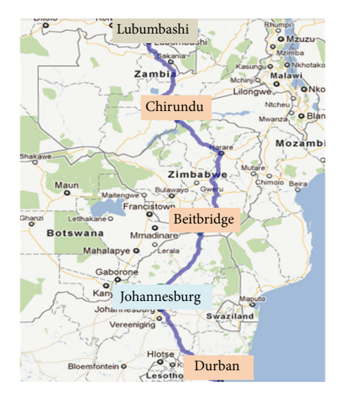
FIGURE 2: North-South corridor across South Africa, Zimbabwe, and Zambia.

HIV-uninfected partners when comparing treatment initiation at CD4 counts between 350 and 550 cells/ \mu L to a delayed start at CD4 counts below 250 cells/ \mu L [24]. Furthermore, in recently published documents, WHO has provided guidance on the implementation and evaluation of demonstration projects of preexposure prophylaxis and early initiation of treatment [25, 26]. Several conditions are prerequisites for effective engagement of patients across the spectrum of HIV care services [27, 28] for these new uses of antiretrovirals for prevention to realise their promise. First, HIV testing should be widely available to facilitate early identification of HIV-positive patients. The identified individuals should be willing and able to start ART at high CD4 counts. HIVpositive patients on ART should then be carefully monitored and supported to maintain high levels of adherence and achieve viral suppression, rendering them less infectious [29] and ultimately decreasing HIV transmission [27, 30, 31]. Mathematical models have assessed the promise of an early ART approach in the general population, with mixed results [32-37]: although similar reductions in incidence are estimated for the short term, long-term predictions vary significantly [38]. However, recent modelling including mobility and limited retention in care have shown that structural barriers to care could be an important limitation for these programmes [39].