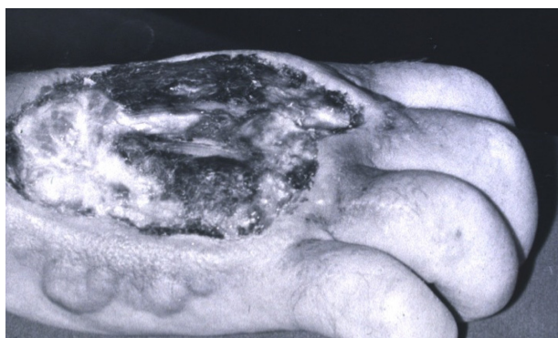
Figure 2 Necrosis after an accidental anthracycline extravasation that was left untreated (before the discovery of dexrazoxane as an antidote).

The prospective trials are unique for all extravasation studies due to the eligibility criteria of histologically verified accidental anthracycline extravasations (positive fluorescence microscopy), and not on the suspicion of extravasation alone. Patients were entered from 24 different European oncology centers and had clinical extravasations of mainly doxorubicin and epirubicin. 52 Dexrazoxane was administered as an intravenous infusion over 1–2 hours: 1,000 mg/m 2 was given within 6 hours after the extravasation injury; 1,000 mg/m 2 24 hours later; and 500 mg/m 2 another 24 hours later. Of 80 patients, 54 had positive biopsies and only one patient developed ulceration that required surgical intervention, corresponding to an overall efficacy