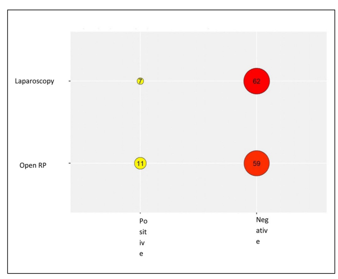
Figure 1. Margins and the method of surgery.