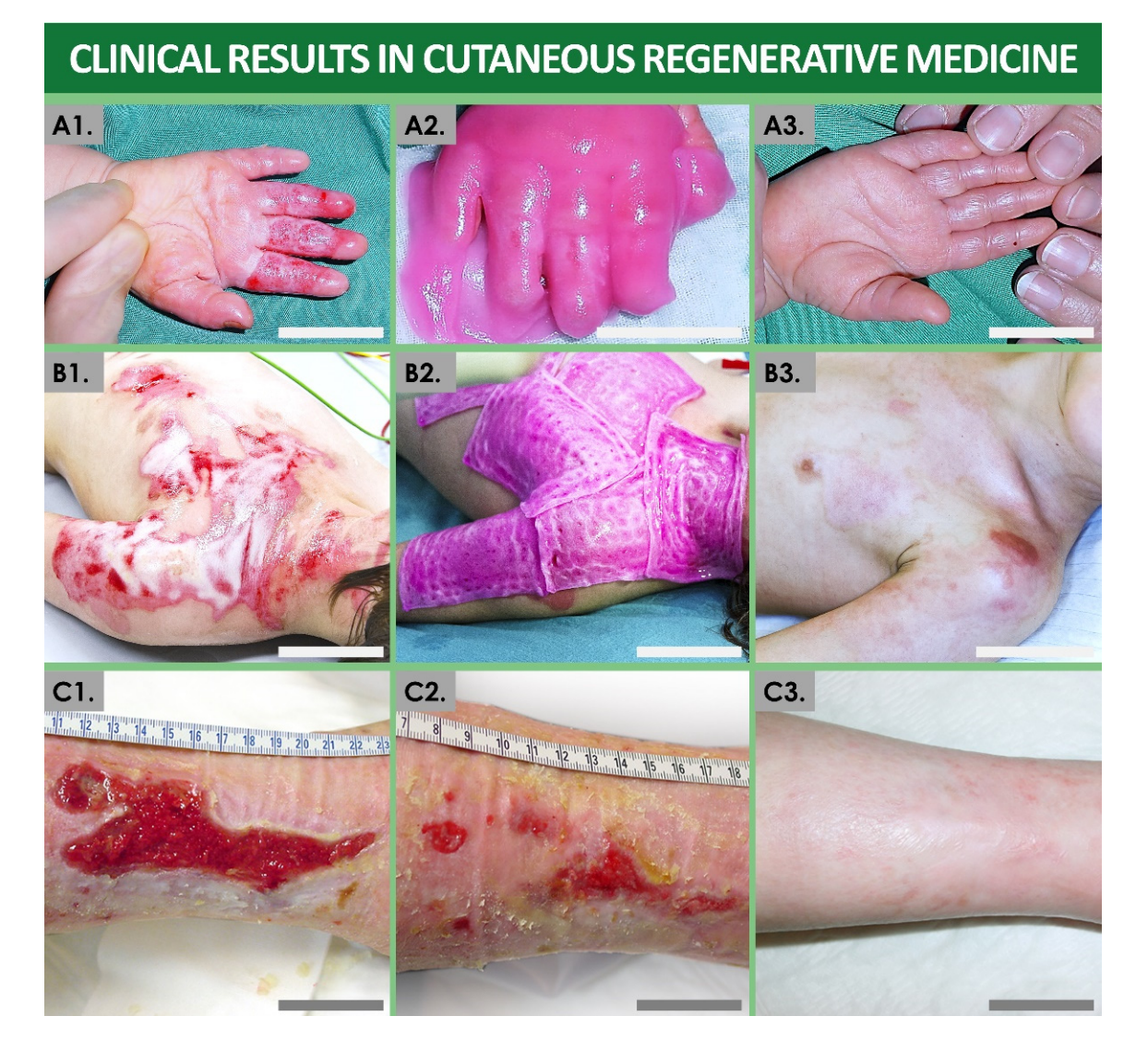
Figure 2. Illustrative overview of obtained clinical results using homologous skin progenitor cell-based PBBs in Swiss allogeneic cutaneous regenerative medicine. ( A ) Second-degree and third-degree pediatric hand burn wound (i.e., caused by scalding liquid). Photographic representations of the lesions after early debridement ( A1 ), after PBB application ( A2 ), and after six weeks of treatment ( A3 ). Scale bars = 2 cm. ( B ) Second-degree deep pediatric torso burn wound (i.e., caused by scalding liquid). Photographic representations of the lesions after early debridement ( B1 ), after PBB application ( B2 ), and after six weeks of treatment ( B3 ). Scale bars = 5 cm. ( C ) Refractory and painful post-thrombotic cutaneous ulcer lesions treated weekly using PBBs. Photographic representations of the lesions at the time of the treatment initiation ( C1 ), 11 weeks later ( C2 ), and 15 months later during follow-up monitoring ( C3 ). Scale bars = 4 cm. PBB, progenitor biological bandage. Modified and adapted with permission from Laurent et al., 2020 [18].

Furthermore, based on a historical review of the high diversity of specific or outstanding treatments proposed in the Swiss market over the past century, several examples were identified as worthy of mention herein (Table 1). Indeed, such products represent important local historical landmarks, and are highly illustrative of the movement toward standardization and pharmaceuticalization of "alternative" treatments in Switzerland during the 20th century. Although the presented preparation types may not be assimilated as cytotherapies, many have revolved around the use of specific tissues, extracts, immunoglobulins, or serum-based components (Table 1).