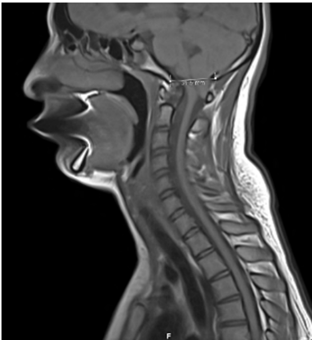
Figure 2. Chiari malformation in 19-year-old female with presumed idiopathic scoliosis (right thoracic) diagnosed using whole spine magnetic resonance imaging (level of brainstem to sacrum). Finally, neuromuscular scoliosis was defined.

NY, USA). Descriptive statistics were expressed in mean \pm standard deviation (SD), median (min-max) or number and frequency.