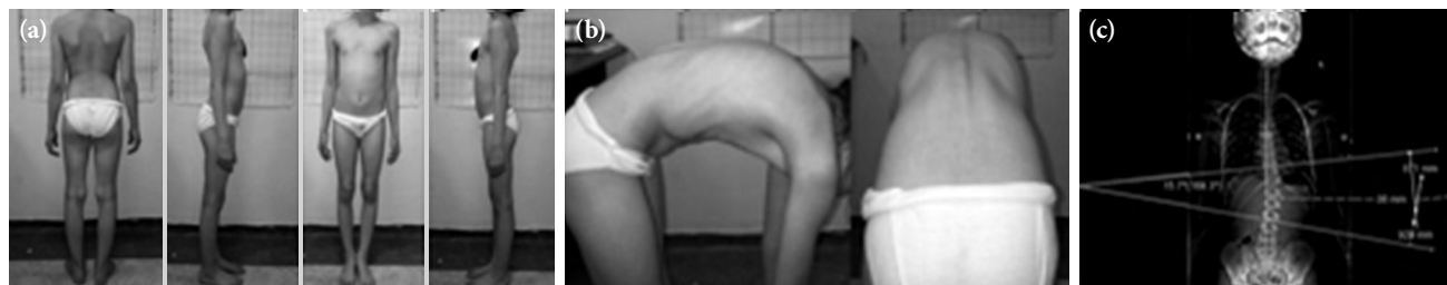
Figure 1. An 11-year-old female with presumed idiopathic scoliosis (left lumbar) in the absence of neurological findings. Syringomyelia was detected based on whole spine magnetic resonance imaging. Finally, neuromuscular scoliosis was defined. (a) An aesthetic profile of trunk of patient affected by spinal deformities. (b) The trunk forward bending test (Adam’s forward test). (c) Cobb angle.

Statistical analysis was performed using the IBM SPSS version 20.0 software (IBM Corp., Armonk,